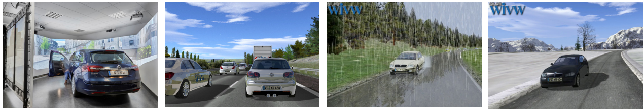
Figure 1: Static driving simulator of WIVW and exemplary virtual scenarios.

crucial advantages compared to in vivo exposure since virtual traffic scenarios can be selectively designed and presented to perfectly fit the individuals' anxieties without real danger and without having to search for the specific situations in real traffic. However, further studies are needed to evaluate VRET efficacy for driving fear with a randomized controlled trial, preferably with an active control group. For a widespread usage it is also important to evaluate the necessary degree of individualization for the driving scenarios (e.g. a package of typical scenarios) and the necessary configuration stages of the driving simulator. In addition, a software package with a user friendly interface is needed as well as a verification of treatment efficacy for in-patient and out-patient settings.