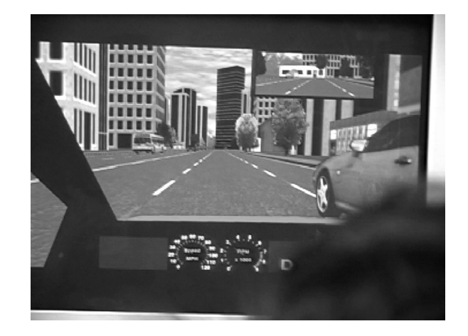
Figure 1. A car merging to the center lane

were to be the final judge of when or whether to respond to any signal during the virtual drive. It was emphasized that safety was their primary concern, even though the environment was simulated.