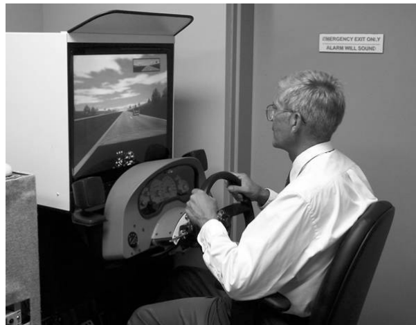
Figure 3. Level 1 FAAC Rabbit Driving Simulator

Level 1 - FAAC Rabbit Simulator. The heavy truck cab lacks air brakes and transmission and 180-degree FOV. The simulator lacks a real feeling steering system for a heavy truck. Although realistic graphics and vehicle dynamics are included, we found the driver took longer to become submerged into the driving scenario on this simulator. List price $25,000 (see Figure 3 below).