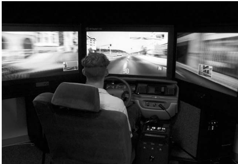
Figure 5. Level 3 Patrol Driving Simulator

Level 3 - Patrol Simulator. An accurate representation of a Crown Victoria, this simulator is generally used for Police and Emergency Response drivers. It can be configured to emulate a heavy truck without air brakes or manual transmission systems. Added plus is the display of 180-degree FOV. List price $160,000 (see Figure 5 below).