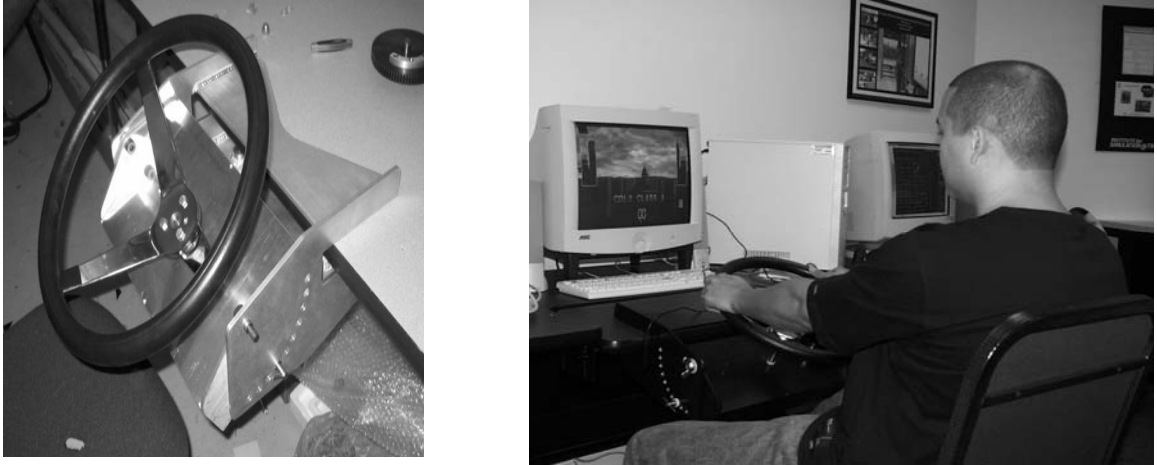
Figure 2. Realistic Steering System Configuration

Level 1 - FAAC Rabbit Simulator. The heavy truck cab lacks air brakes and transmission and 180-degree FOV. The simulator lacks a real feeling steering system for a heavy truck. Although realistic graphics and vehicle dynamics are included, we found the driver took longer to become submerged into the driving scenario on this simulator. List price $25,000 (see Figure 3 below).