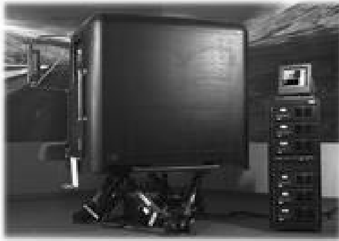
Figure 6. Level 4 Mark II Full-Motion-Based Truck Driving Simulator

projected FOV. Another added feature is the rearview mirrors. List price = $500,000 (see Figure 6 below).