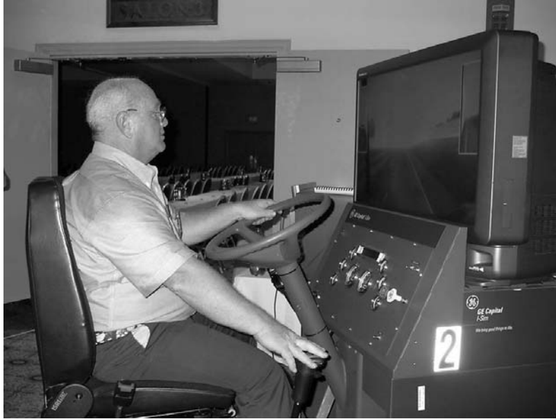
Figure 4. Level 2 VS2 Truck Driving Simulator

Level 3 - Patrol Simulator. An accurate representation of a Crown Victoria, this simulator is generally used for Police and Emergency Response drivers. It can be configured to emulate a heavy truck without air brakes or manual transmission systems. Added plus is the display of 180-degree FOV. List price $160,000 (see Figure 5 below).