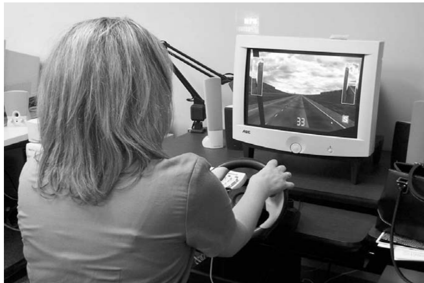
Figure 1. Level 1 PC Driving Simulator with Joystick Configuration

Level 1 - PC Simulator. Runs same software as levels 2 and 3 with minor modifications. Single channel, lacks air brakes, and transmission and 180-degree FOV (see Figure 1 below). A steering system created by IST/UCF design and engineering teams replaced the joystick steering. A real 14” steering wheel and robust gear reduction allows two modes—car and truck. Production price was $1,000. This steering system succeeds in making the driver feel more in control and in making the PC driving simulator seem more realistic as opposed to just a glorified games(see Figure 2 below). Production price with realistic steering system = $6,000.