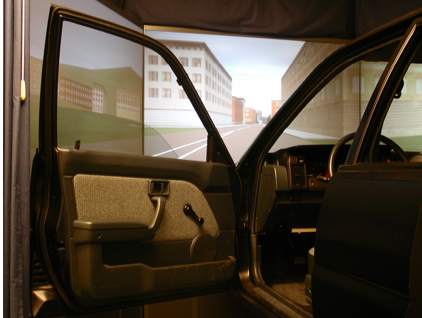
Figure 1. Argus Driving simulator

The test-program consisted of 70 traffic situations, each presenting a different challenge to the driver. The situations required the driver to deal with situations that one would frequently encounter when driving a car, and had been designed to specifically address situations assumed to be extra challenging for persons with acquired brain injury.