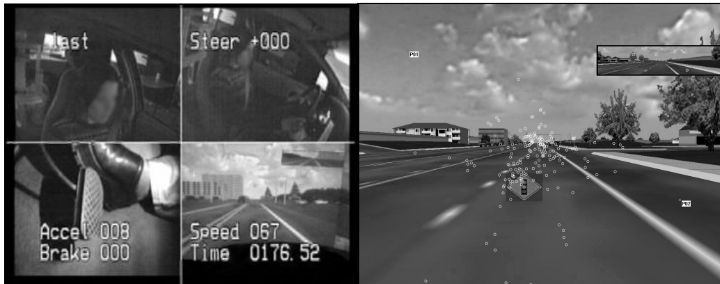
Figure 1. The image on the left shows a screen capture of the interior of the simulator with brake, accelerator, speed and steering variables overlaid. The image on the right illustrates the diamond in-vehicle sign with the corresponding area of interest (AOI) surrounding it. Fixations for the 4 seconds that the HUD was on prior to the intersection are shown as white dots.

Of the 48 intersections encountered, 24 included signal changes to amber. Half of the changes were 1.73 s and the other half were 2.21 s prior to the stop line of the intersection. The occurrence of lights that changed were randomized within each drive. In accord with positive guidance principles (see, e.g., Alexander & Lunfield, 1986), the rectangular and diamond sign icons were displayed for 4 seconds in the HUD format 12 s to 8 s in advance of the intersection (see Figure 1, right panel).