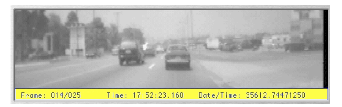
Figure 2. Example frame from an exposure video showing a passenger car as the lead vehicle

vehicle were likely too different to be consistent with "active following," and may instead have been the beginning or the end of a passing maneuver.