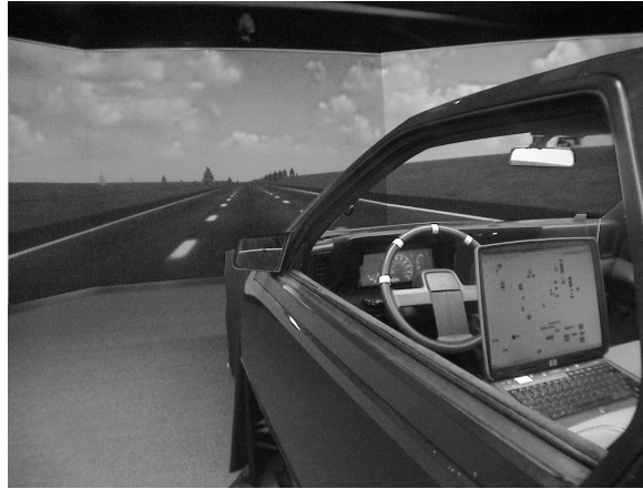
Figure 3. QN-MHP steering the driving simulator