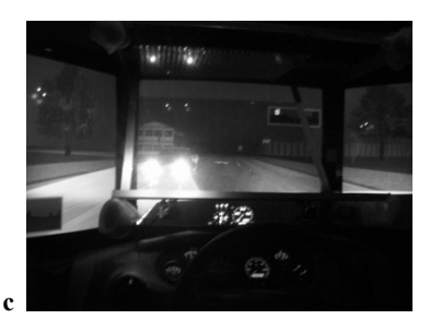
Figure 2. The night driving scene (a) without the glare system enabled, (b) simulating a distant vehicle, (c) simulating a close vehicle. The display and beam splitter can also be seen in (b) and (c).