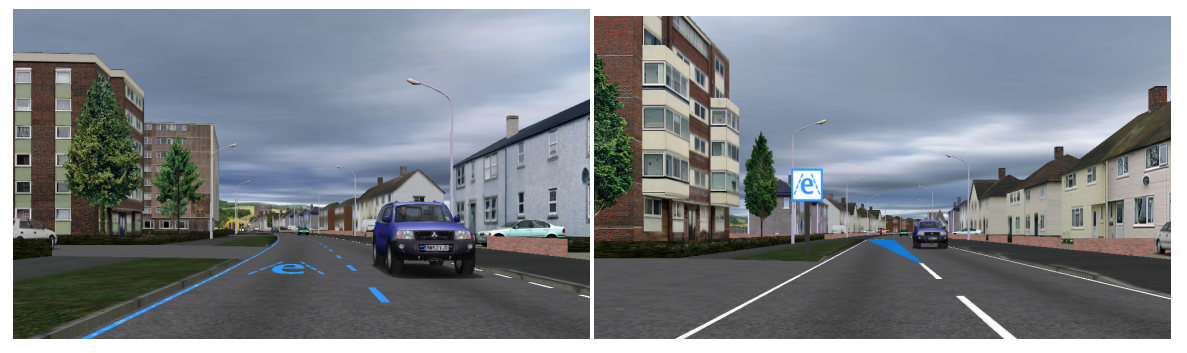
Figure 2. The road markings (left) and sign (right) used to denote the eLane

Automated driving occurred on an 'eLane' (Flemisch, 2005; Scheiben et al., 2008), which was clearly marked on the road (Figure 2). Participants were alerted about the approach of the eLane via the in-vehicle interface as well as a sign which appeared to the side of the road, 50 m before the start of the eLane. Upon entering the eLane, drivers were required to transfer control of driving to the vehicle's automated system, by pressing the on/off button on the steering wheel. Once the interface confirmed that the system was active (audio-visual message), drivers took their hands off the steering wheel and their foot off the accelerator pedal and effectively watched the vehicle being driven for them. They were, however, asked to continue monitoring the driving task at all times. If, for whatever reason, drivers wished to regain control of the vehicle within the eLane, they could turn the automated system off by moving the steering wheel, pressing the on/off button on the steering wheel or depressing the brake pedal.