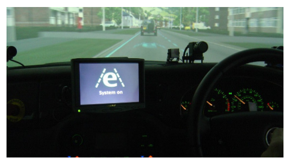
Figure 1. The in-vehicle interface

the in-vehicle interface (Figure 1), which was used to