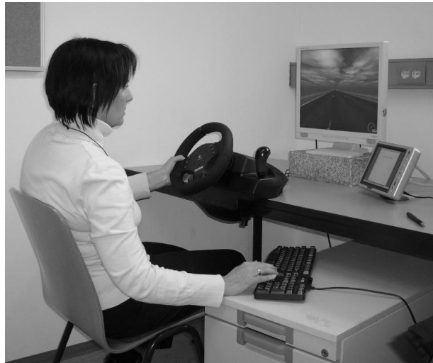
Figure 1. LCT Setup

Critical Tracking Task (CTT). As a secondary task, we used a Critical Tracking Task (Jex, McDonnell, & Phatak, 1966). The CTT was chosen since it is under discussion for being a suitable calibration task for the LCT. The basic challenge is the manual control of a dynamic unstable element. This element is a simple horizontal bar on an 8.37" screen that tends to leave the proposed target position at the centre of the screen. While the bar moves up or down permanently, subjects can counter this deviation by using the up and down keys on a keyboard. The task allows for the variation of difficulty by letting the experimenter choose the level of (in-)stability. Three different levels of difficulty were used in our experiments. The standard deviation from the central position is used as a performance indicator.