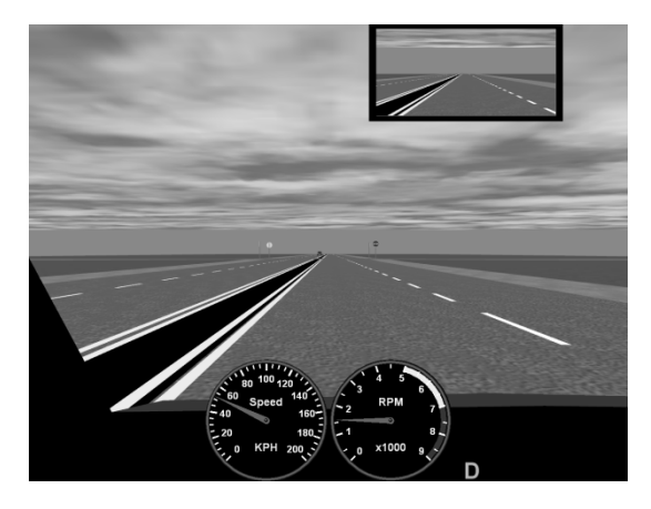
Fig 1. High information processing scenario (left) and low information processing scenario (right)

The resulting manipulations were combined and resulted in four distinct scenarios: 1) High demands on information processing and high demands on vehicle handling 2) High demands on information processing and low demands on vehicle handling 3) Low demands on information processing and high demands on vehicle handling 4) Low demands on information processing and low demands on vehicle handling 4) Low demands on information processing and low demands on vehicle handling 4).