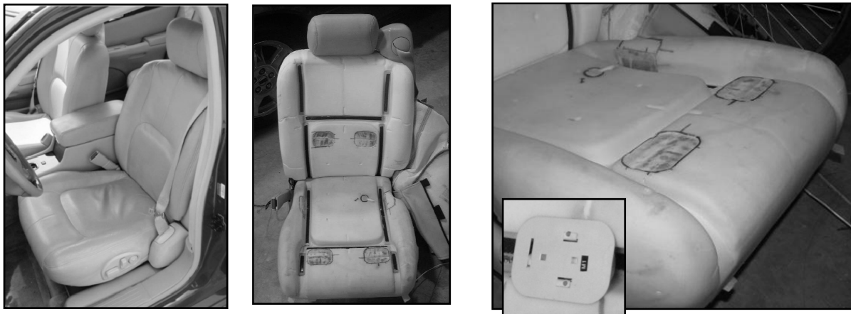
Figure 1. Mounting of the four inertial shaker factors. The two upper factors in the seat back were not used