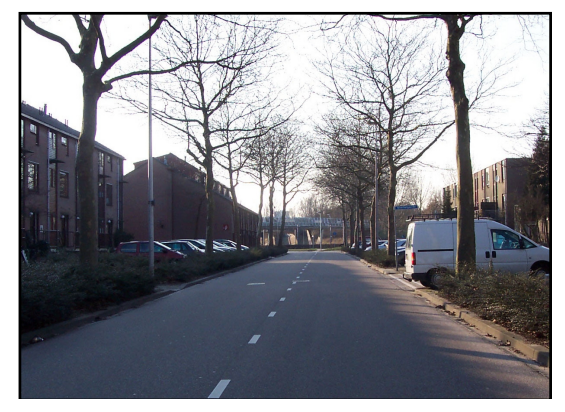
Figure 1. An example of a simple (left) and complex (right) situation in the Adaptation Test