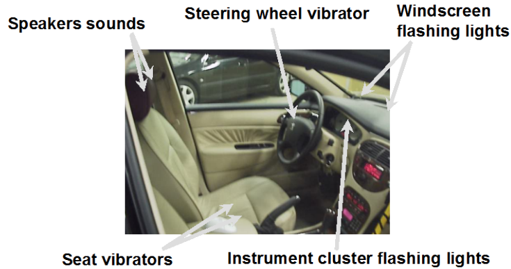
Figure 1 : Prototyped and tested HMI