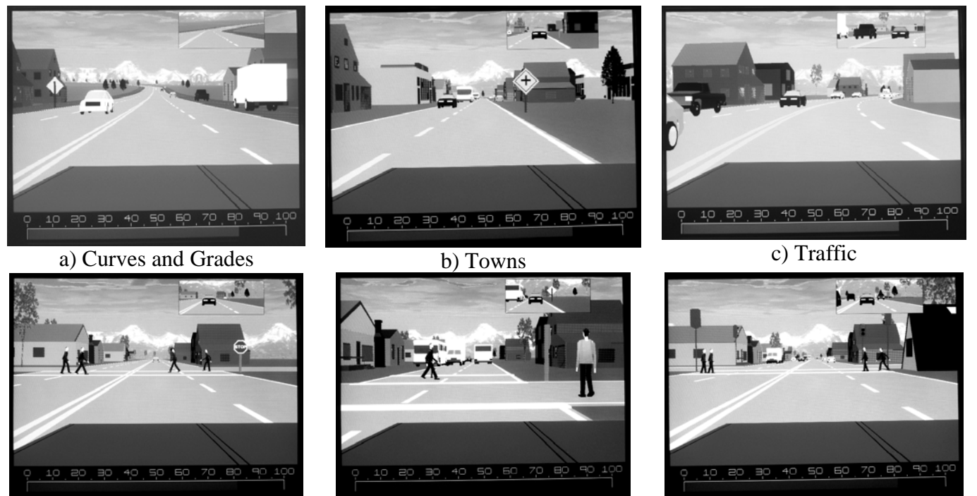
D) Intersections with Traffic and Pedestrians Figure 1. Typical Driving Scenario Elements

Events were set up relative to the appearance of the driver in both time and distance. Time critical events were triggered on the basis of time to go, so that subjects were presented with constant decision times independent of their speed. This is accomplished in the SDL by having an event (e.g. signal green to yellow, pedestrian stepping off the curb, vehicle pulling into subject's path) triggered at a critical time defined as distance to go divided by subject vehicle speed. The time to go is continuously computed as the subject approaches an event horizon, and the event is triggered upon reaching the event horizon. This event control procedure was originally developed for driver decision-making research (Allen, Schwartz, et al., 1978), and allows events to be triggered with critical timing (e.g. stop or go at a signal, stop or slow down or change lanes to avoid an encroaching vehicle or pedestrian, etc.).