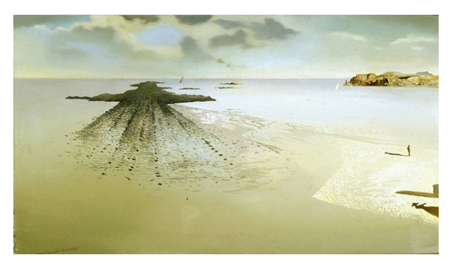
Figure 3: Salvador Dali, Anthropomorphism, extra flat, 1936. © Fundació Gala-Salvador Dalí. VEGAP/Copyright Agency, 2022.

Coinciding with the publication of Minotaure in June 1936, an important exhibition by Dalí opened in London. Among the oils that could be seen in the British capital, which had been occupied by the surrealists following the first International Exhibition of Surrealism, was Anthropomorphism, Extra Flat (fig. 3), an oil on wood of small dimensions (11 x 19 cm), like the vast majority of the oils that Dalí painted at the moment. In 1970, Dalí retitled the image Geological Justice and described the painting as "[s]orte de paysage-figure, par terre, les deux bras écrasés et ouverts" 'a kind of landscape-figure, spread out on the ground, both arms crushed and open,' adding that he had painted it in Port Lligat (Museum Boymans-van Beuningen ill. 42). This last piece of information inevitably leads us to think that the painting probably depicts the landscape of the Costa Brava. However, the scene painted by Dalí corresponds to a dike on the Helgoland dune on the German coast, a geological formation to which La nature (1905-1: 93) dedicated a few pages in 1905. Dalí replicated one of the images in this article, and he only had to trace it on the wood, enlarging the dimensions of the emptier landscape at the bottom and to the right. The result is a painting that depicts a slightly larger coastal panorama than the magazine illustration.