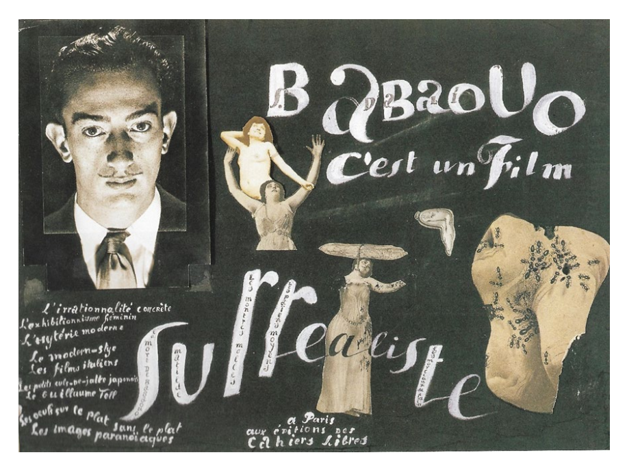
Figure 1: Salvador Dali Babaouo Poster, 1932.