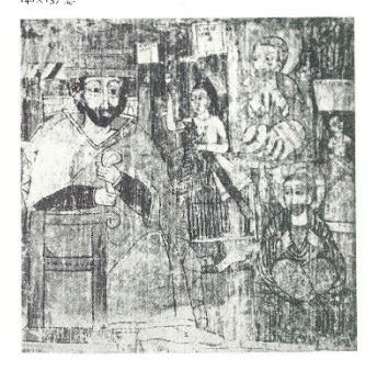
Figure 2: Marcel Griaule's "Peintures abyssines" about the wall paintings from the Saint Antonius Church in Gondar. Minotaure, no. 2, 1933, p. 83. Universitätsbibliothek Johann Christian Senckenberg, Frankfurt am Main.

Détail du fanneau des Rois, Mur Est. Église Antonios de Gondar 140×137 ‰.