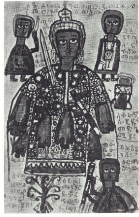
Резиптят гнаде : Яхуусе Тениндия

medium through which he expresses himself.<sup>17</sup> It is remarkable that the page layout in Minotaure reproduces the hierarchy of male domination inherent in the possession cult, as the gouache representing Seyfou Tchenguer is placed on the upper left side of the page presiding over the photographic portrait of Malkam Ayyahou on the lower right side.