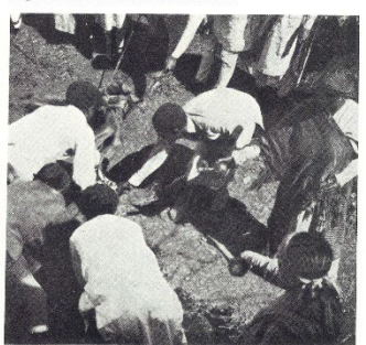
Figure 7: The Bull Sacrifice. In Michel Leiris. "Le taureau de Seyfou Tchenger." Minotaure, no. 2, 1933, p. 76. Universitätsbibliothek Johann Christian Senckenberg, Frankfurt am Main.