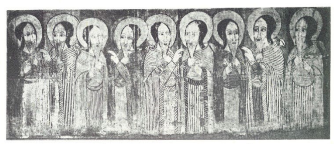
Praes de l'Écliez. Côté degit du mur Sud. Écliez Antonios de Gondar (Ethiopie septentrionale). 140×340 ¾