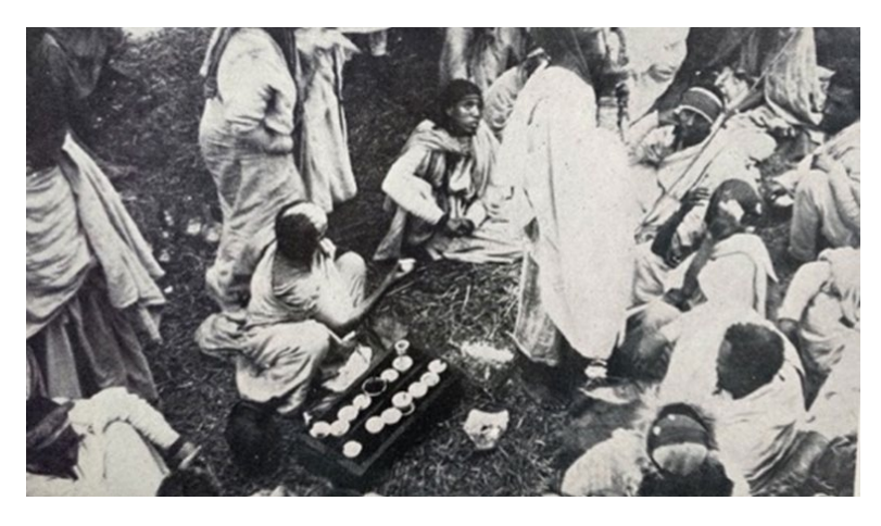
Figure 9: Coffee Ceremony. Michel Leiris. "Le taureau de Seyfou Tchenger." Minotaure , no. 2, 1933, p. 81. (Photo: Marcel Griaule). Universitätsbibliothek Johann Christian Senckenberg, Frankfurt am Main.

Leiris's essay seems to interrogate the idea that ethnographic photography can "embody" the unseen spirits that are perfectly visible for the participants in the ritualistic bull sacrifice. Moreover, only the explicatory text is able to "visualize" them in the readers' minds as it draws their attention to the unseen spirits. Griaule's images thus depend on Leiris's text that, despite its descriptive and impersonal style, triggers the readers' imagination and makes them change their vision of the images as they try to detect what cannot be seen in the photographs. The way the text interacts with the images reveals the tension between transparency and opacity. Griaule's positivist claim that his panoptical method of photography would achieve the best possible transparency of ethnographic observation stands in contrast to Leiris's concept of documentation that renders the pictures poetically opaque and mysterious by referring to the invisible phantoms populating them as well as by frustrating the desire of Minotaure 's readers to become witnesses of "primitivist" possession.