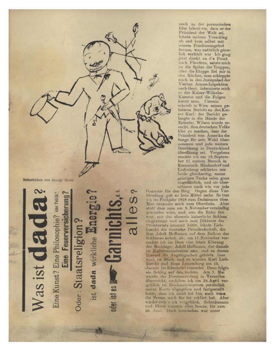
Figure 3: Page 6, Der Dada 2, ed. Raoul Hausmann (September 1919), International Dada Archive, Special Collections, University of Iowa Libraries.

Similarly, these periodicals provided a new kind of exhibition space, one that orients itself toward a larger, more complex network of communication and information, and thereby asks viewers to reorient their own positions. The dadaists had tried to replicate the experience of seeing a given piece in a gallery space in their journals, but now they moved away from an emphasis on trying to approximate the standard phenomenological aims of exhibitions. Instead they