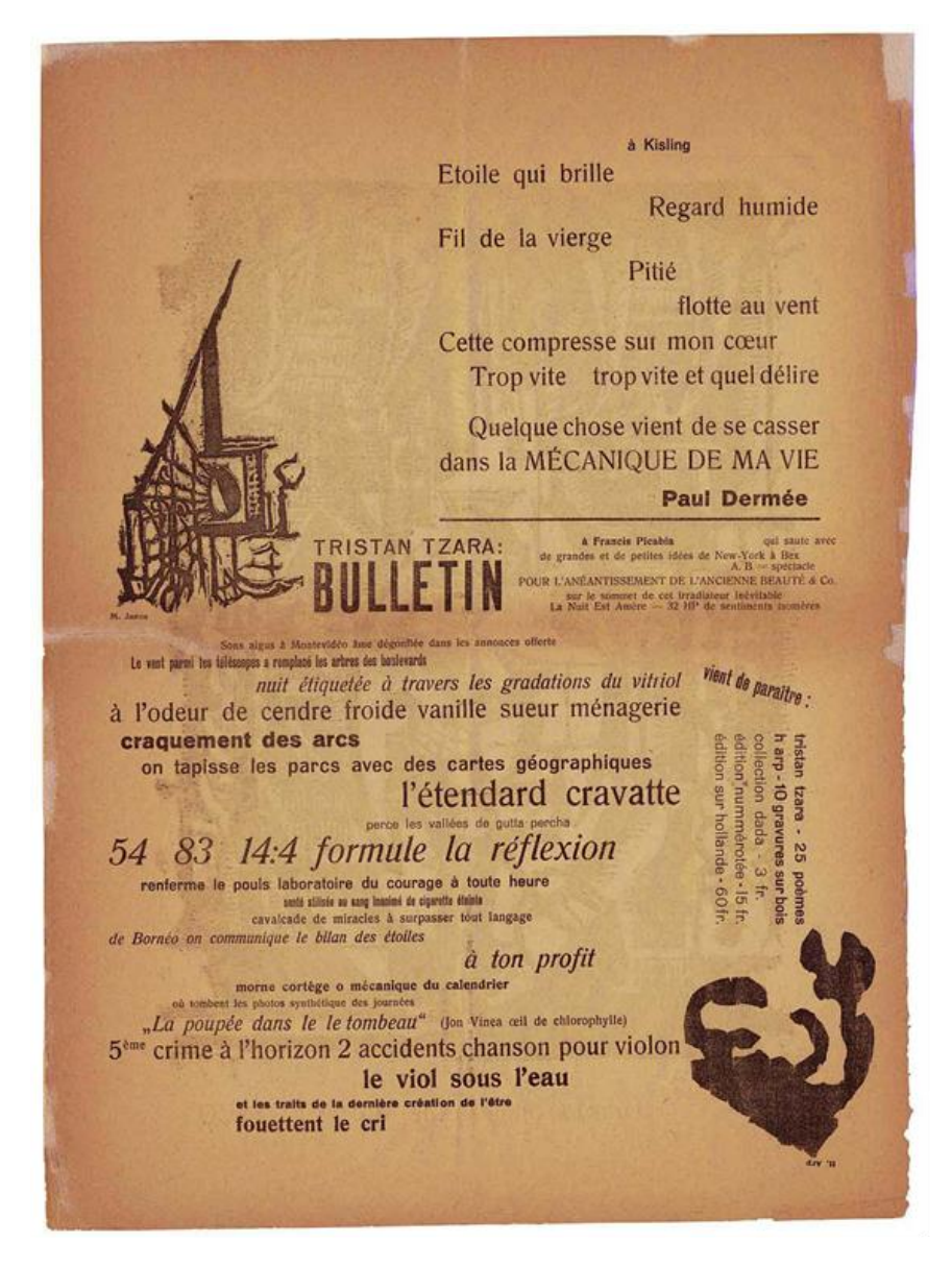
Figure 2: Page thirteen, Dada 3, ed. Tristan Tzara (Zurich, December 1918).

The pages also stress the nature of text as image. The strong diagonal on the left side of Janco's architectonic, almost calligraphic, composition, for example, accentuates the slope of the lines of the poem below, and the tentacles of Arp's biomorphic shape point toward the advertisement. In Der Dada 1, similarly, a