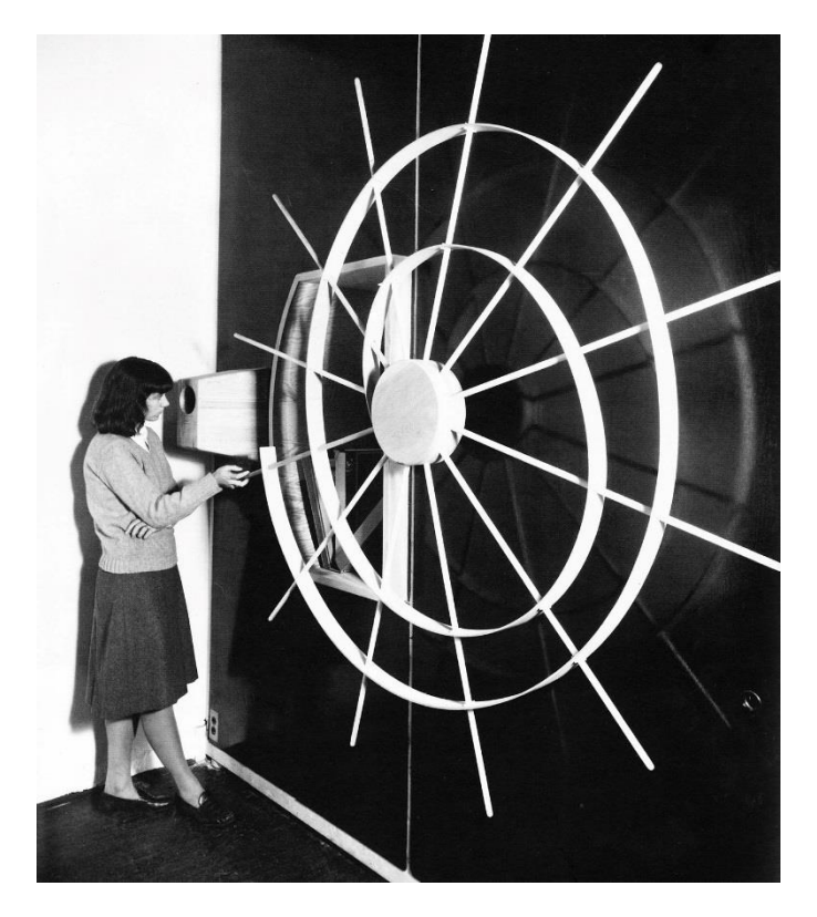
Figure 3: Viewing Mechanism for Duchamp's Boite-en-valise (1935-41), Kinetic Gallery, Art of This Century Gallery. 1942.

(Pollock 45). 31 Women, an exhibition suggested by Duchamp (Guggenheim, Out of this Century 279), featured work by Leonora Carrington, Leonor Fini, Meret Oppenheim, Djuna Barnes, Frida Kahlo, Gypsy Rose Lee, Louise Nevelson, Kay Sage, Xenia Cage, Elsa von Freytag-Loringhoven, and Dorothea Tanning (Dearborn 204), and can be seen as a critical response to Barr's 1937 Fantastic Art, Dada, and Surrealism exhibition. As the press release stated, "any doubt that there might only be a limited number of works by women that could come under the heading of 'fantastic' was soon dispelled. The paintings and sculptures finally selected show extraordinary imagination and . . . a meticulous technique. Here then is testimony to the fact that the creative ability of women is by no means restricted to the decorative vein. . . " (Davidson and Rylands 292).41