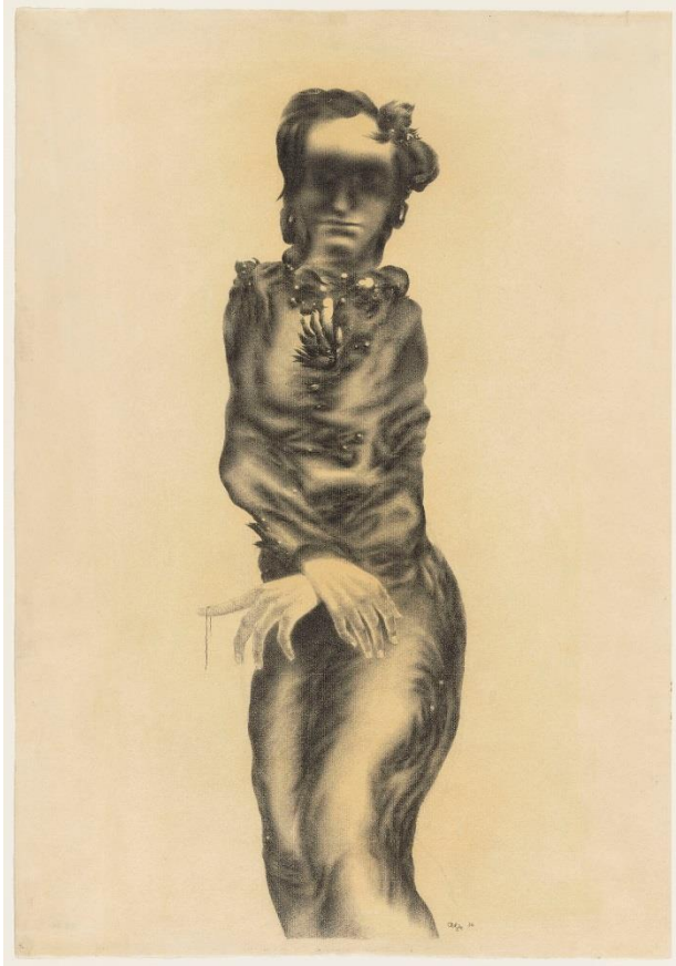
Figure 4: Richard Oelze, Frieda , 1936. Conté crayon on paper, 24 7/8 x 17 1/4" (63.2 x 43.8cm). The Museum of Modern Art, New York, NY, U.S.A.

Oelze claimed in a letter to Alfred Barr that he destroyed the painting Frieda , but a charcoal sketch (1936) – likely mailed by Loy – was included in Barr’s 1937 surrealist exhibition, along with Oelze’s painting Daily Torments (1934). 61 In