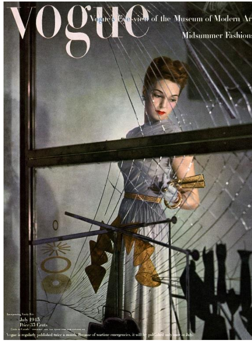
Figure 2: Erwin Blumenfeld, cover of Vogue , July 1945. © Condé Nast and The Estate of Erwin Blumenfeld.

A different superimposition of the female body on Duchamp's Bride appeared in former Berlin dadaist Erwin Blumenfeld's July 1945 Vogue cover photo (fig. 2) of a model standing behind the Large Glass at MoMA (Koch 288). 29 Dreier's loan of the Glass to the museum had made this photo possible, and in a letter to James Johnson Sweeney, Director of Painting and Sculpture, Dreier angrily denounced