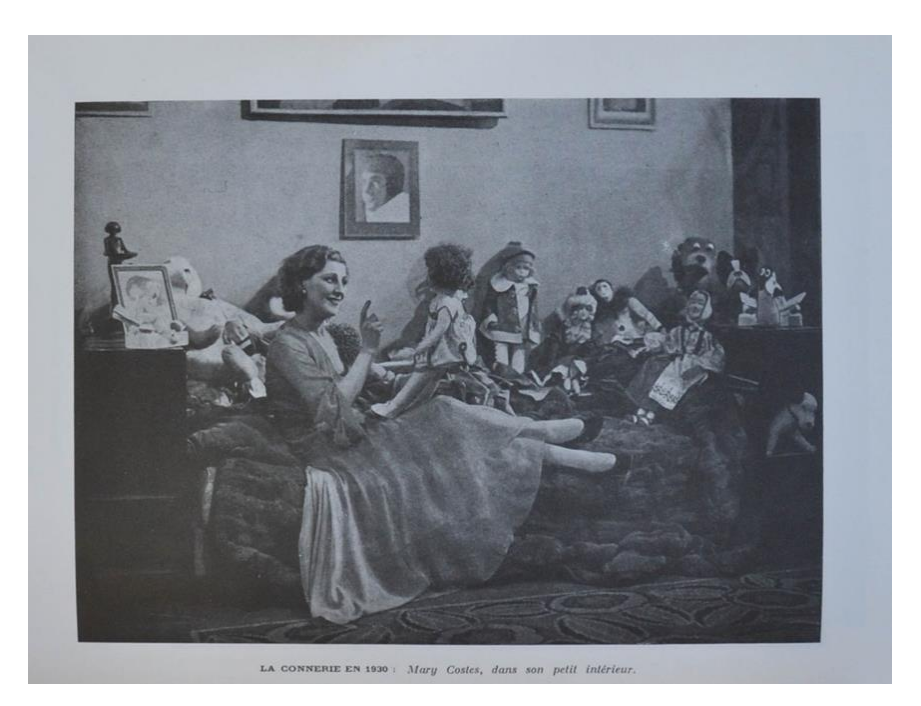
Figure 3: Le Surréalisme au service de la révolution 2 (July 1930): final page.

The first is Éluard's short article attacking the special edition of Vu published to celebrate the centenary of the French Tricolor. That edition (no. 121, 30 June 1930) was dominated by propaganda about how much Algeria had benefitted from French colonialism in terms of education and medical provision. Photographs were used to support the claims made throughout the magazine about the supremacy of France and its produce. The article entitled "The triumph of French taste: Parisian Couture " contrasted French elegance to the "hideous Germans" and "monstrous Americans." In his text Éluard ridicules articles in the issue, stating that "The most seductive women in the world are French" and "The French military machines are the fastest in the world," and concludes that "Damned stupidity is French, the pox is French, pigs are French" (Critique 25). Second, the photograph of Maria Costes references the article entitled "Sur Lénine" which consists of a short text by Lenin's widow, Nadezhda Krupskaya, taken from her recently published memoirs. She describes how Lenin detested "bourgeois sentimentality" in the image of