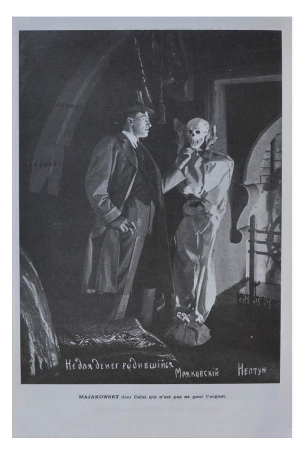
Figure 1: Film still showing Mayakovsky in Not for Money Born , 1918. Le Surréalisme au service de la révolution 1 (July 1930): final page.