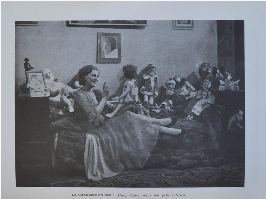
Figure 3: Le Surréalisme au service de la révolution 2 (July 1930): final page.

The first is Éluard's short article attacking the special edition of Vu published to celebrate the centenary of the French Tricolor. That edition (no. 121, 30 June 1930) was dominated by propaganda about how much Algeria had benefitted from French colonialism in terms of education and medical provision. Photographs were used to support the claims made throughout the magazine about the supremacy of France and its produce. The article entitled "The triumph of French taste: Parisian Couture " contrasted French elegance to the "hideous Germans" and "monstrous Americans." In his text Éluard ridicules articles in the issue, stating that "The most seductive women in the world are French" and "The French military machines are the fastest in the world," and concludes that "Damned stupidity is French, the pox is French, pigs are French" (Critique 25). Second, the photograph of Maria Costes references the article entitled "Sur Lénine" which consists of a short text by Lenin's widow, Nadezhda Krupskaya, taken from her recently published memoirs. She describes how Lenin detested "bourgeois sentimentality" in the image of