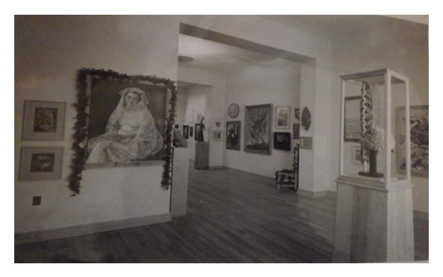
Figure 1: A view of the display of the exhibition.

Since the 1930s, surrealist art installations had sought to change the way viewers observed art. According to Lewis Kachur, from the early thirties onward, the main focus of surrealism shifted towards a search for "convulsive beauty" – a display of "the marvelous" – themes that later became the slogans for surrealist artistic display (Kachur 23). In this context, the gallery was a location in which to enact a translation of dreams into the space, forming a visually provocative and unsettling environment for the aesthetic experience of the public.