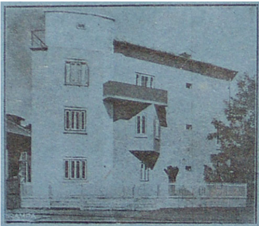
Figure 3: Marcel Iancu, Construcție modernă (Modern Construction), Contimporanul 69 (Oct. 1926): cover. © 2015 Artists Rights Society (ARS), New York / ADAGP, Paris.