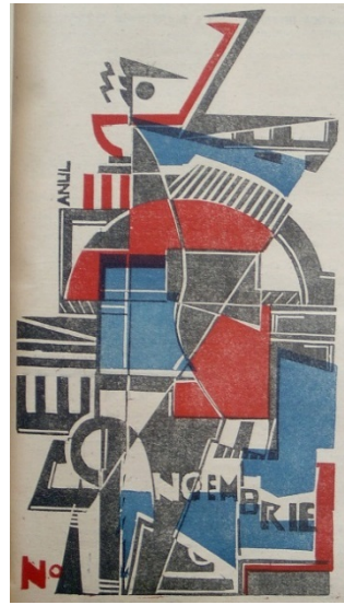
Figure 2: Marcel Iancu, Linoleum. Contimporanul 49 (Nov. 1924): n.p. © 2015 Artists Rights Society (ARS), New York / ADAGP, Paris.