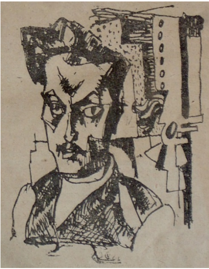
Figure 1: Marcel Iancu, Auto-portret (Self-Portrait). Contimporanul 25 (6 Jan. 1923): cover. © 2015 Artists Rights Society (ARS), New York / ADAGP, Paris.