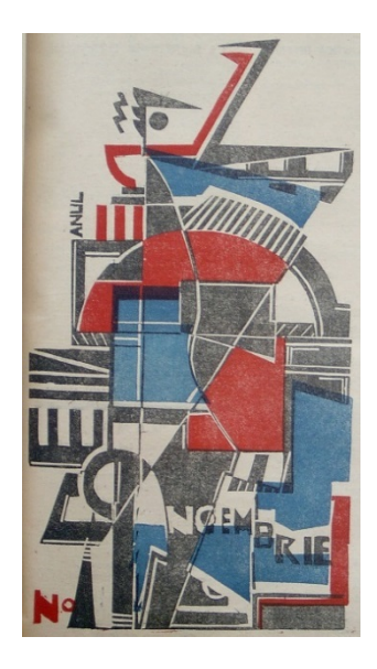
Figure 2: Marcel Iancu, Linoleum . Contimporanul 49 (Nov. 1924): n.p.