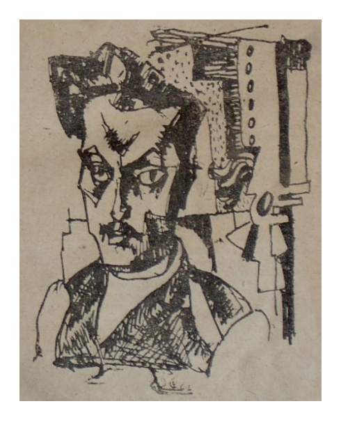
Figure 1: Marcel Iancu, Auto-portret (Self-Portrait). Contimporanul 25 (6 Jan. 1923): cover.