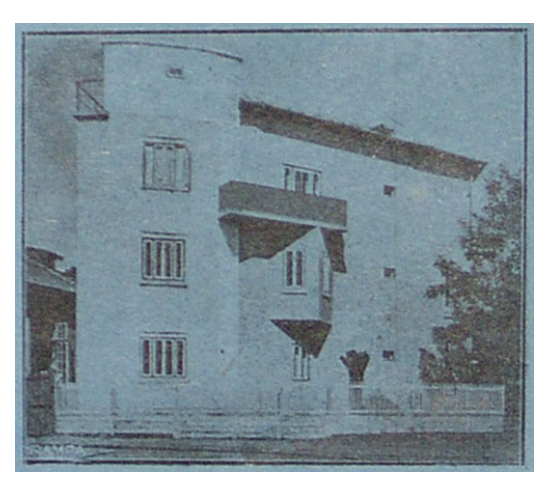
Figure 3: Marcel Iancu, Construcție modernă (Modern Construction), Contimporanul 69 (Oct. 1926): cover. © 2015 Artists Rights Society (ARS), New York / ADAGP, Paris.