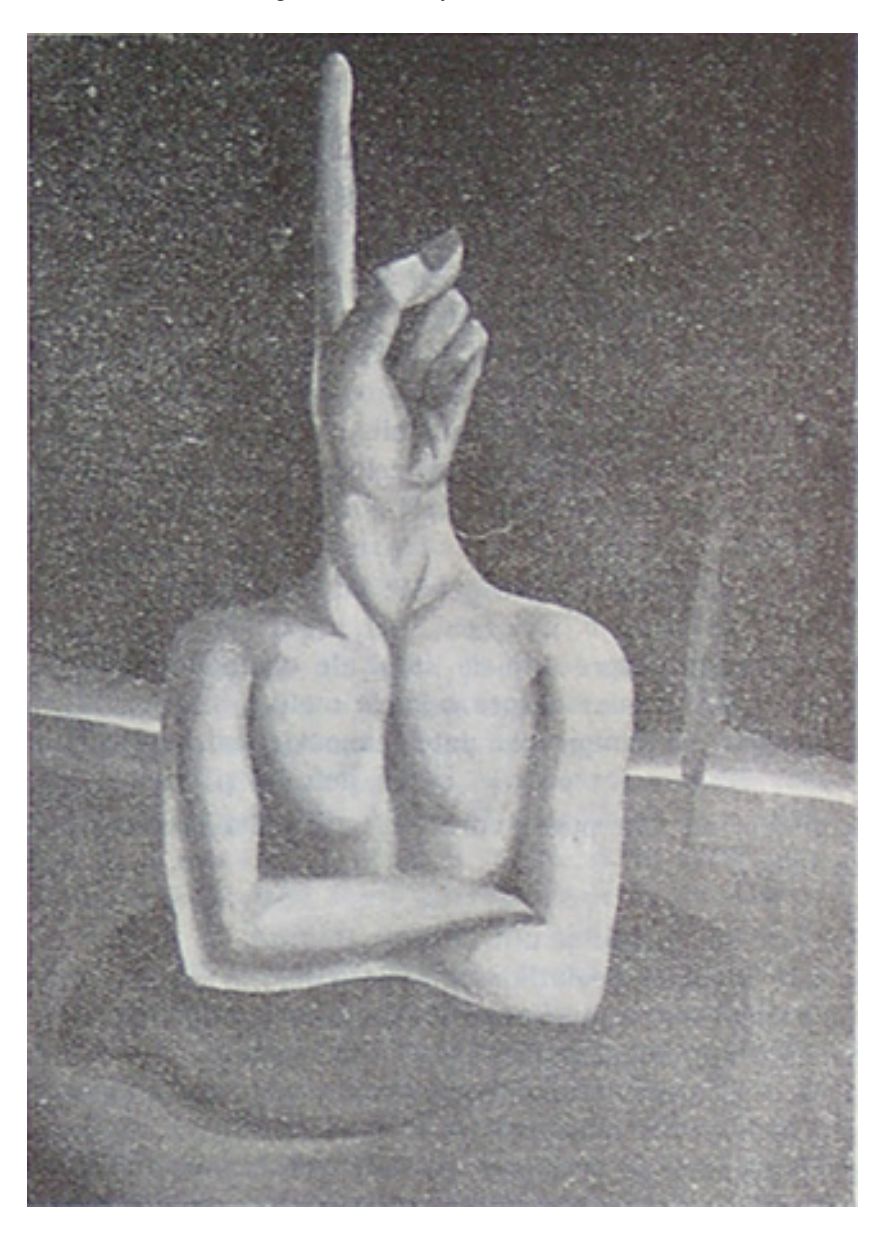
Figure 6: [Perahim], Dumnezeu trăiește din mila mea (L'Anti-prophète) (God Abides in My Mercy / The Anti-prophet), [1932]. Lost (reproduced from Unu 5.49 (Nov. 1932)). © Perahim/ADAGP by permission of the artist's estate.

content to block the way . We can no longer expect anything from sphinxes or prophets; for questions and answers, we can no longer depend on anyone but ourselves. We can no longer count on anyone but ourselves to be oracles.