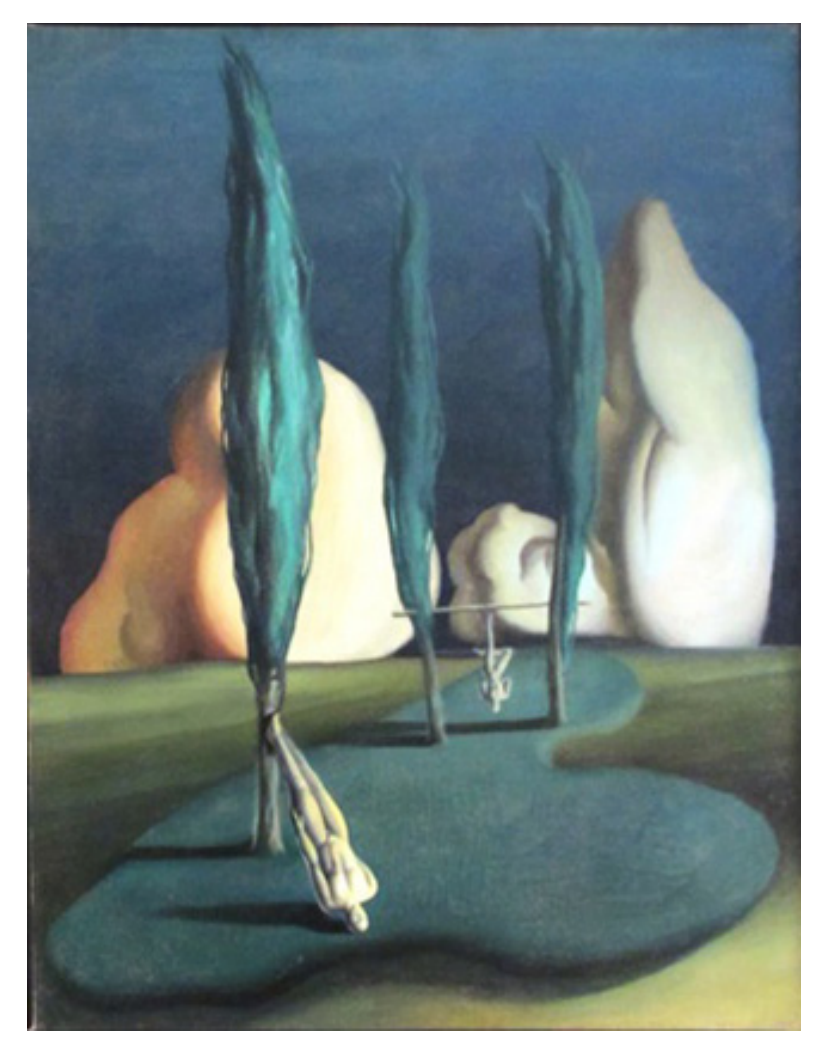
Figure 7: [Perahim], Echilibru perfect (L'Équilibre parfait) (Perfect Balance), [1932], oil on canvas (65 x 50 cm.). Private collection. Photograph by M. Bertola. © Perahim/ADAGP by permission of the artist's estate.

Dominguez or the Danes Freddie and Bjerke-Petersen, it was Dalí who seemed to go the furthest in debasing sacred values and therefore appeared as an example to surpass (not simply to follow); an example apprehended with feverish enthusiasm, not rationally. One Romanian voice that movingly expressed this enthusiasm with respect to a personal quest was that of M. Blecher, whose portrait Perahim painted for Blecher's book titled Adventures in Immediate Irreality (1936). Born in 1908, Blecher would die of a grave, incurable illness at the age of thirty, after spending the last ten years of his life practically immobilized by the disease.