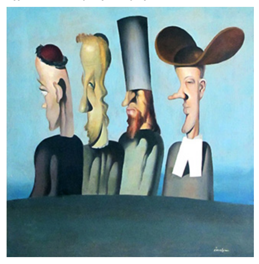
Figure 4: Perahim, Profilul unei morale (Profile d'une morale) (Profile of a Moral Code) [1934], oil on cardboard (50 x 49 cm). Private collection. © Perahim/ADAGP by permission of the artist's estate.

alas, but few. In Romania, the most reactionary forces rose to power and imposed a state of siege and censorship of the press. "Le pays se divise en deux camps opposés, de droite et de gauche" 'The country is splitting into two opposing camps of right and left,' wrote Marina Vanci. "Au milieu, c'est de plus en plus le vide" 'In the middle, there is increasingly only a void.' Indeed, there were 300,000 unemployed in the country and labor strikes multiplied, despite the ruthless repression. As for the clerical hierarchy of the various confessions, they fully supported the most retrograde pressure groups.