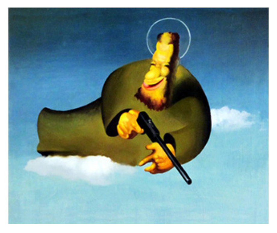
Figure 5: [Perahim], Joc de tată vitreg (Jeu de beau-père) (Stepfather's Game) [1934], oil on canvas (32.2 x 41 cm). Private collection. Photograph by M. Bertola. © Perahim/ADAGP by permission of the artist's estate.

Romania) line up side by side. The synthesis of caricature and painting attains a kind of perfection here: indeed, if deforming the traits fully achieves its purpose, which is to deride the targeted subject and make it as odious as possible, the composition's resolutely "modern" arrangement on the page, the perfect modeling of the vestimentary attributes, the hair, and even the "crudely hewn" faces clearly demonstrate that Perahim had no intention of abdicating his pictorial privileges. This vengeful caricature is at the same time an excellent "metaphysical" canvas; only here, the mannequin-like figures are coming out of the crevices of their sacristies, not a dressmaker's workshop in Ferrari, as in the paintings of De Chirico and Carra.