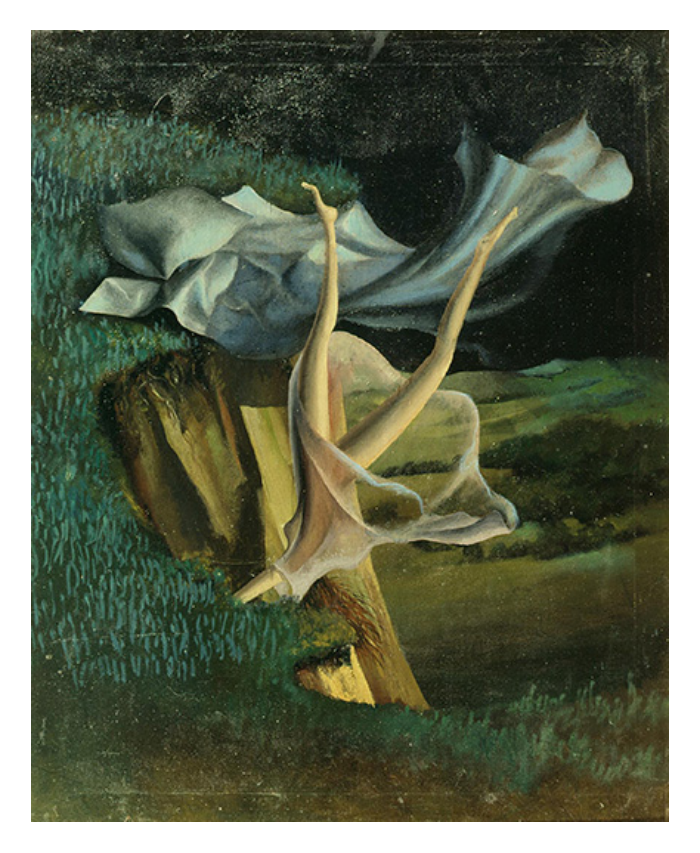
Figure 2: [Perahim], Vis de fată tânără (Rêve d'une jeune fille) (Young Girl's Dream), [1932], oil on canvas (68 x 54 cm) Galleria Nazionale d'Arte Moderna, Rome (gift of Arturo Schwarz). © Perahim/ADAGP by permission of the artist's estate and Ministero dei Beni delle Attività Culturali e del Turismo.

vanishing lines in the floor drawn in perspective, pillars rise to heights beyond the top edge of the canvas. Two spirals of smoke curl around the colonnade and grow increasingly opaque as they dip toward the ground, where they are transformed into a corporeal phenomenon, not exactly a feminine body but rather a configuration whose substance evokes the "ectoplasms" dear to spiritualists. This is the first in a long line of Perahim's chimeras still seen in his work today. Curiously, these first paintings by Perahim emit the same "bewitching" quality as young Arthur Harfaux's photomontages, created at the time of Le Grand Jeu , "où apparaissent dans une pénombre mystérieuse des combinaisons de fragments humains" 'where combinations of human fragments appear in a mysterious twilight." <sup>11</sup>