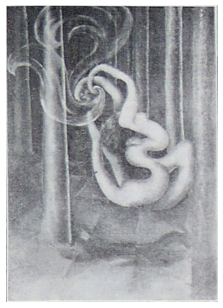
Figure 1: [Perahim], Femeia numărul doi (Femme 2) (Woman Number Two) [1931]. Lost (reproduced from Unu 5.45 (May 1932)). © Perahim/ADAGP by permission of the artist's estate. Rights in all of Perahim's works are held by Marina Vanci-Perahim.

The term "lyrical materialization" fits well with the first of them, titled Woman Number Two <sup>10</sup> (1931) (fig. 1): in a hall (of an enshrouded cathedral or a castle in the Carpathian Mountains?) whose proportions seem to be vast, judging from the