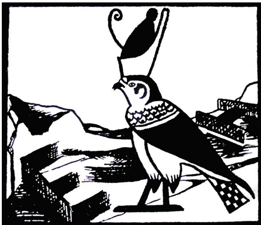
Figure 1: Editions Horus Logo (Le Caire). Dir. Horus Schenouda.

A contemporary of Georges Henein, Horus Schenouda, also alluded to the ancient significance of the hawk: "Le faucon Horus a toujours les ailes déployées dans les effigies, les bas-reliefs et les figures magnifiques qui ornent les temples, les édifices des Pharaons qu'on admire toujours..." (Untitled manuscript 2). ("Horus the hawk always spreads his wings in effigies, bas-reliefs and the splendid figures adorning the temples, these Pharaoh edifices that we still admire...")