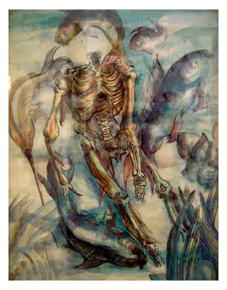
Figure 4: Amy Nimr, Untitled , 1936. Watercolor on paper. This painting was on show at the second Art and Liberty Group exhibition, © Mathaf: Arab Museum of Modern Art.