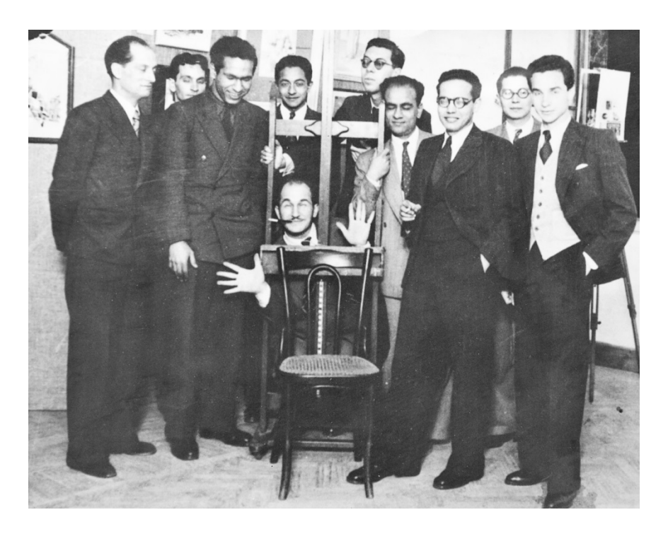
Figure 3: Anonymous, The Art and Liberty Group, 1941, © Sonia Younan.