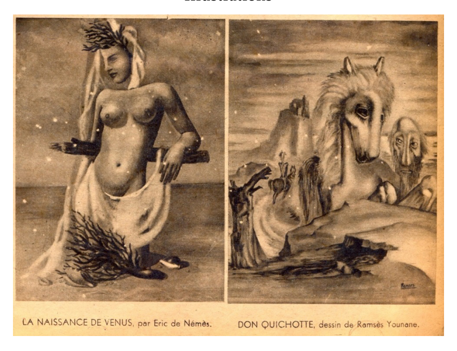
Figure 1: La 2eme Exposition de l'Art Independent . Exhibition Review by M. Cavadia, © Revue Images Archives, Dominican Library, Cairo.