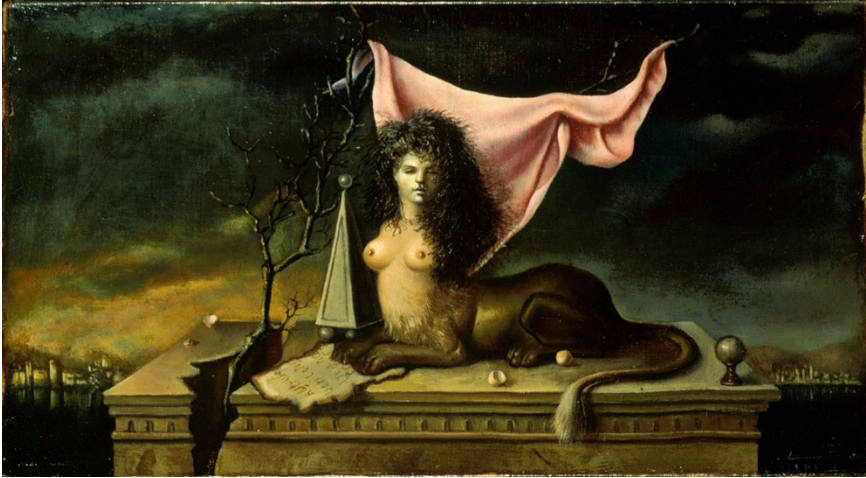
Figure 2: Leonor Fini, Little Guardian Sphinx , 1943–44, oil on canvas, location unknown, © ADAGP, Paris and DACS, London 2012/Galerie Minsky, Paris.

Philosopher's stone. The sphinx may, by extension, be seen as the marriage or fusion of these qualities, as the birth of the couple, the androgyne, or the 'Great Work'. The triangular object beside her further represents a fusion of mind, body and spirit in alchemical symbolism, and so perfection beyond sexual difference.