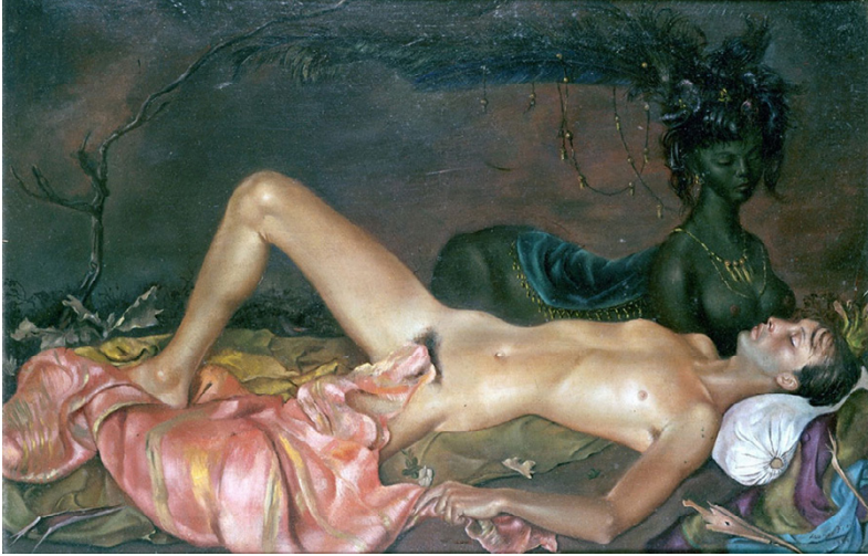
Figure 3: Leonor Fini, Chthonian Deity Watching over the Sleep of a Young Man , 1946, oil on canvas, location unknown, © ADAGP, Paris and DACS, London 2012/Scala, Florence.

not consider the contribution of women surrealists to this genre, nor does she focus on the sphinx, but her overview makes the important point that artists “used mythology to illuminate the present” (154). Fini’s sphinx should be viewed as an assertion of such humanism at a time of brutality, as a symbol of good and evil at a time when world events forced the individual into a state of existential self-questioning.