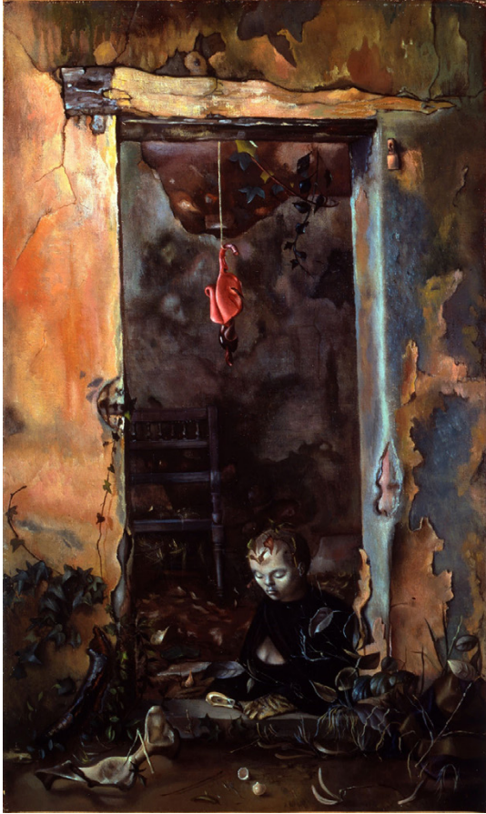
Figure 4: Leonor Fini, Little Hermit Sphinx , 1948, oil on canvas, Tate Modern Collection, London, © ADAGP, Paris and DACS, London 2012/Galerie Minsky, Paris.

Little Hermit Sphinx of 1948 further reminds us of the matriarchal emphasis of Fini's imagery and how the sphinx is frequently posed in a reflective, existential manner in her oeuvre. Fini portrays a little sphinx in the doorway of a ruined building with bones and a broken eggshell in the foreground. Her gaze is reflective as her eyes look not at the viewer, as in most sphinx images, but down at her paw, which touches a small skull. Her head is shaved, a sign that she is a priestess, a guardian in Fini's personal symbolism. The painting was made after Fini had surgery on her bladder and uterus to remove a cancerous tumor, which left her unable to bear children. The artist did not lament the loss, stating in her 1993 interview with Webb: "The thought of having children horrified me" (Webb 133). That said,