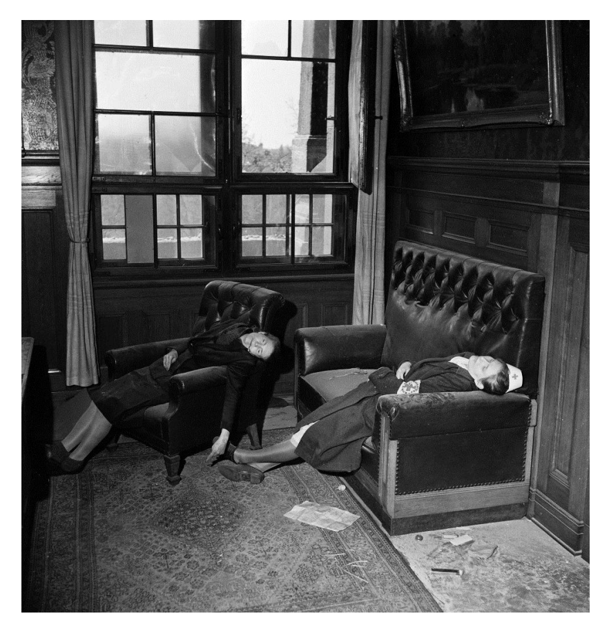
Figure 3: Lee Miller, Suicides in Town Hall , Leipzig, Germany 1945, © Lee Miller Archives, England 2012. All rights reserved. <u>www.leemiller.co.uk.</u>

eyes, a resemblance evoking a line in David Gascoyne's 1932 poem Roman Balcony : "the deserts where enormous Eyes stare out of the Sand into the Sky" (82). This dimension works also through the portrait format of the frame which is sewn into the net, framing the space of the sky, and the cloud formation which evokes Man Ray's painting Observatory Time – The Lovers (c. 1931). Painted in landscape format, this painting offers an image of Miller's lips looming large in a cloudy sky. This painting is arguably part of Man Ray's own dissection of Miller's body (in the form of repeatedly including representations of fragments of Miller's body in his works), echoing the colonial dissection of the Egyptian landscape into archaeological fragments mentioned above.