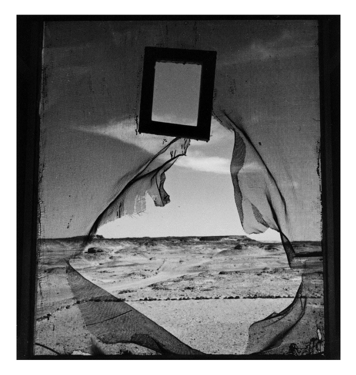
Figure 2: Lee Miller, Portrait of Space , Nr Siwa, Egypt 1937, © Lee Miller Archives, England 2012. All rights reserved. <u>www.leemiller.co.uk.</u>

Conventional criticism has approached Miller's photographs of Egypt mostly chronologically, repeatedly regarding these images as specific to a distinct period in her career and specific to her biographical/psychological circumstances. For example, Haworth-Booth describes Miller's famous photograph of the Egyptian desert, Portrait of Space (1937), as a "representation of her psychological state" (139).