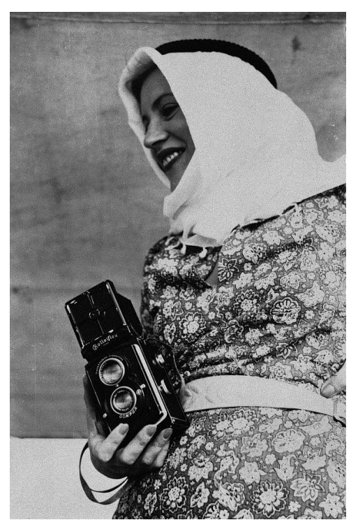
Figure 1: Unknown Photographer, Lee Miller Holding her Rolleiflex Camera, Egypt 1935, © Lee Miller Archives, England 2012. All rights reserved. <u>www.leemiller.co.uk</u>.

A photograph taken in Egypt in 1935 shows Lee Miller holding a Rolleiflex camera. While her face immediately creates associations with her identity as a significant model in the worlds of fashion and art, she is also represented here as a professional photographer, and as an international citizen – an American woman wearing an Arabic (male) headdress and holding a German Rolleiflex.