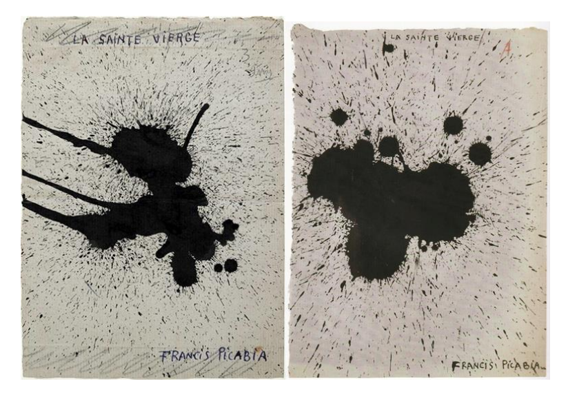
Figure 4 (Left): Francis Picabia, The Virgin Saint I , 1920. Ink and pencil on paper, 33 x 24cm. Centre Pompidou.

definitive form and public life in 391 . More plausibly, the Virgin Saint II was produced first and deemed unsatisfactory for some reason before the decisive version was made. The large A in the top right-hand corner of The Virgin Saint II certainly suggests it is primary, although the handwriting has not been verified as Picabia's. At the very least, it seems likely that both drawings were made in a single session. As Adrian Sudhalter has recently noted, the paper stock is identical in each drawing (123). Both drawings also exhibit a telling combination of straight and torn edges, indicating that they were cut from a larger sheet of paper. Although their edges do not align, it is quite feasible that both drawings originated on the same leaf. Sudhalter hypothesizes that both drawings may have originally formed opposite corners of a larger sheet and that another two lost drawings may have been created on the same piece of paper (123).<sup>24</sup>