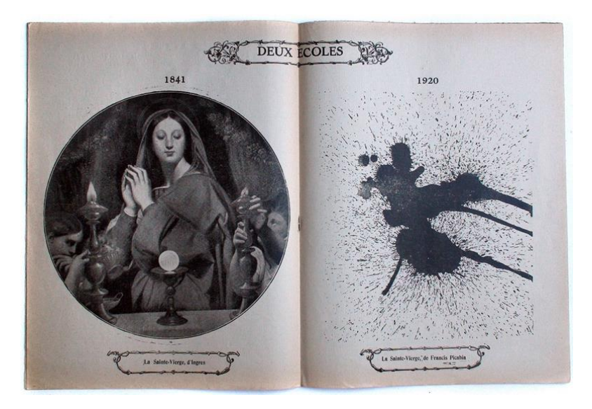
Figure 6: Anon. "Deux Ecoles," Les Hommes du Jour , 9 April 1920. (Author's collection).

La Crapouillot was not the only magazine to respond to 391. In an intriguing afterlife, La Sainte-Vierge was reprinted a month later in the paper Les Hommes du Jour. Under the title "Deux Écoles" (Two Schools), the article contrasted Picabia's virgin saint with another by Ingres (fig. 6). Setting Picabia's drawing on the righthand side, the run-off from La Sainte-Vierge is tellingly positioned to flow away from Ingres's virgin. Inadvertently, the comparison reiterated a distinction Picabia himself had already made. In the first issue of 391 Picabia mocked Ingres and his privileged place in the work of Picasso and within the revival of French classicism.32 Throughout the Return to Order Picabia would continue to assault Ingres, appropriating and bastardizing the French master's work to form the base of own.<sup>33</sup> It is plausible therefore that Picabia was aware of Ingres's painting Joan of Arc at the Coronation of Charles VII (1854) which established the artistic convention of depicting Joan with a halo. As staunch Orleanist and antirepublican, Ingres incorporated a rare self-portrait into the picture, actively associating himself with the Saint (Heimann 132-76). This painting - an "inordinate technical pedantry" in Baudelaire's summation (cited by Heimann