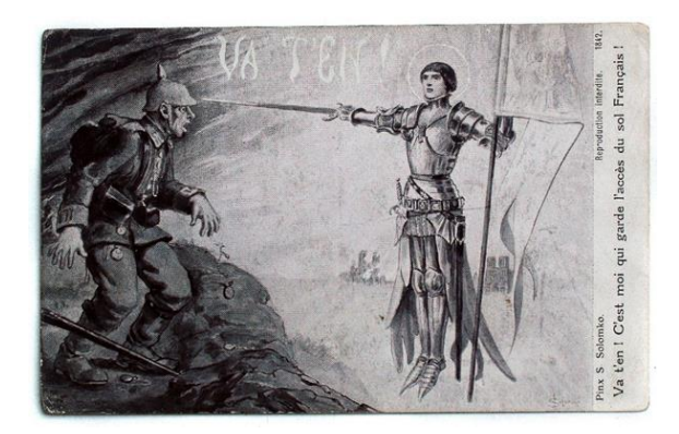
Figure 2: Sergey Solomoko, Go Away! Illustrated French postcard, 1914. (Author's collection). <sup>12</sup>