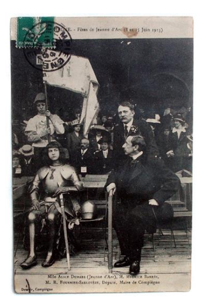
Figure 3: Anonymous photographer, French postcard depicting Maurice Barrès (seated) with Alice Dumars as Joan of Arc at the Joan of Arc Fête, 1913. (Author's collection).