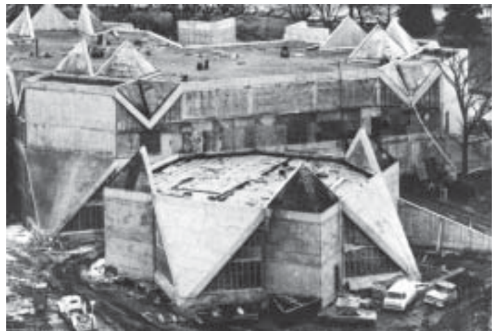
Health Sciences Library under construction, 1973

Along with expansion of the University Hospitals and Clinics and construction of the Dental Science Building, the Bowen Science Building, and the College of Nursing Building, the Hardin Library was part of an amazing building surge that took