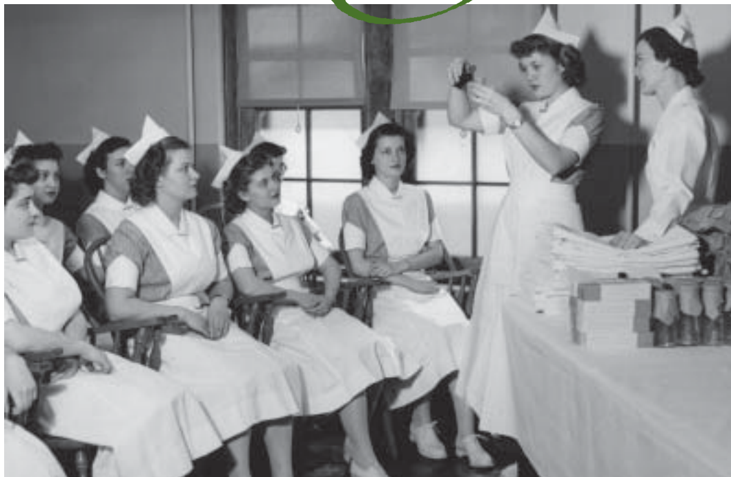
Sophomore nursing students learning to pair medications, March 1948, UI College of Nursing Records