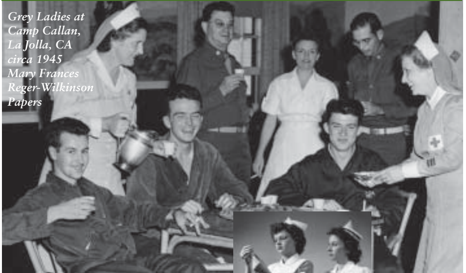
Grey Ladies at Camp Callan, La Jolla, CA circa 1945