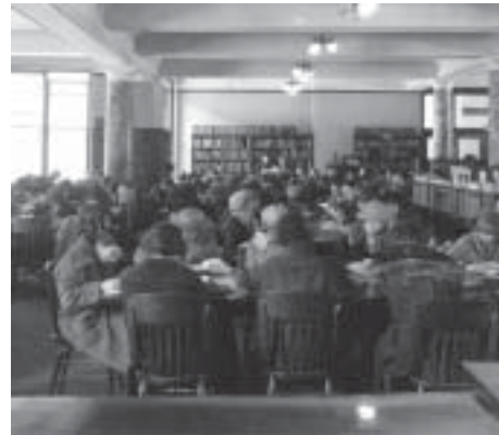
Library in the Hall of Natural Science, January 1926 (renamed Macbride Hall in 1934)

In 2005, the Libraries will celebrate 150 years as the intellectual center of the University. We will be commemorating this occasion with special exhibitions and campus and community events. Watch for more information in upcoming issues of Bindings .