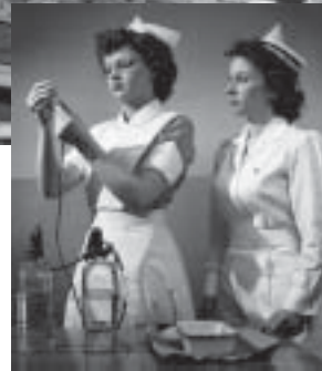
1948 UI College of Nursing records