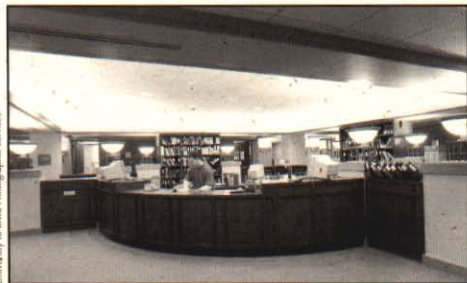
Front Desk, The Marvin A. Pomerantz Business Library