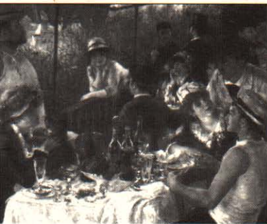
The Luncheon of the Boating Party, Pierre-Auguste Renoir, as depicted on the cover of The Impressionists' Table: Recipes and Gastronomy of 19th Century France, Rizzoli, NYC, 1994

She will discuss the fascinating world of 19th century cafes, picnics, concerts and restaurants and their significance to such painters as Edouard Manet, Claude Monet, Auguste Renoir, Paul Cezanne, Mary Cassatt, Berthe Morisot, Vincent Van Gogh and Henri de Toulouse-Lautrec.