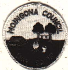
Merit Badge for Camping, Moingona Girl Scout Council c. 1971