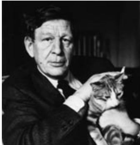
W. H. Auden portrait from The Table Talk of W. H. Auden in Special Collections.

Like a lot of other institutions, libraries have changed a lot in the last fifteen years. I walk by computer labs, snack bars and a media center on the way out of the building. I have used each of these services at some time. For me, though, the library is about the mind—loosening it up, giving it