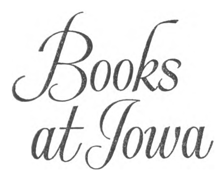
Number 25, November 1976