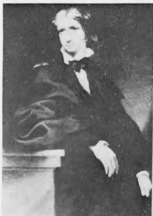
LEIGH HUNT, by MARGARET GILLIES