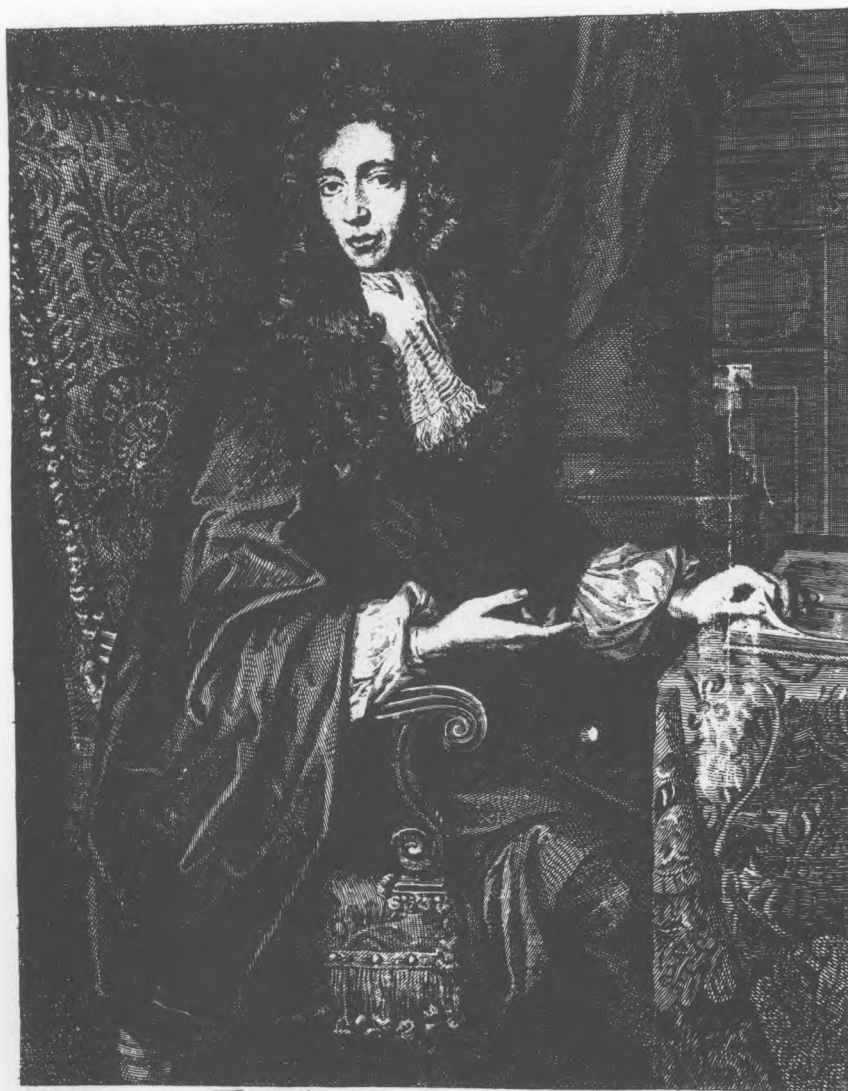
The Honourable ROBERT BOYLE.