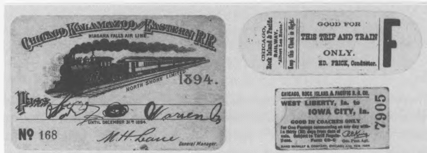
An annual pass and two Rock Island tickets.