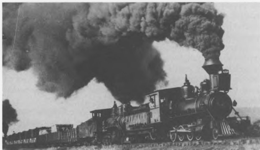
Two Denver & Rio Grande Western engines (nos. 419 and 411) near Mears Junction, Colorado, 1910.

All of it will redound to the benefit of amateurs and professionals alike. All aboard!