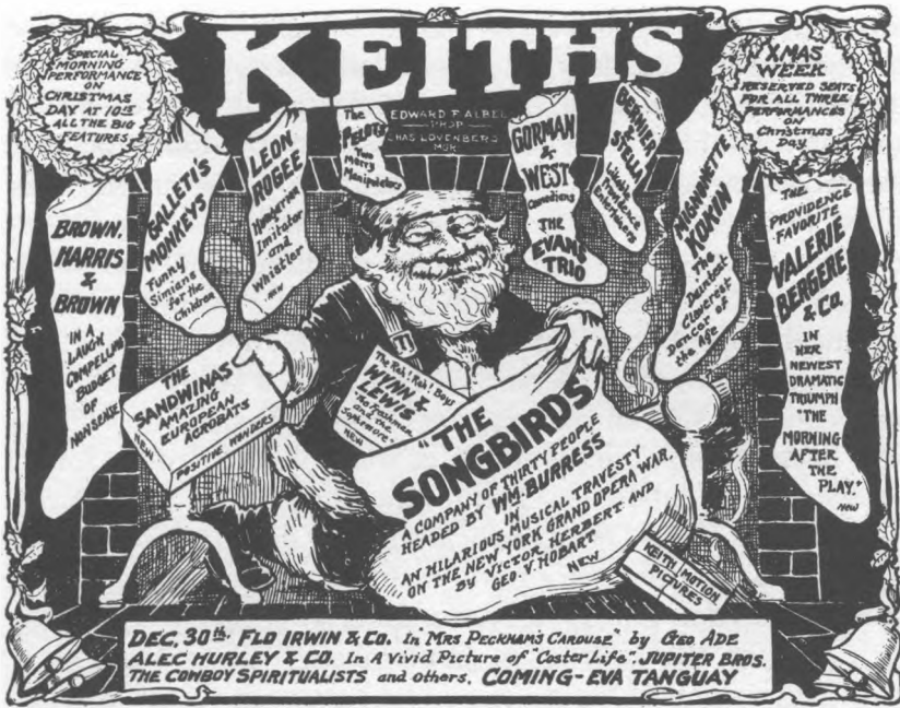
This advertisement for Keith's Theatre appeared in Providence area newspapers on December 22, 1907.

The Keith/Albee collection also includes five volumes of reviews of "New Acts" from Variety and the New York Clipper , two trade newspapers. These reviews are more detailed than those provided by vaudeville managers in the report books but they are difficult to use because they are undated and describe acts from various parts of the country. Therefore, although a researcher may happen to match a helpful description of a performer in "New Acts" with a manager's evaluation in the report books, there is no fast way to locate performers in the five volumes of "New Acts."