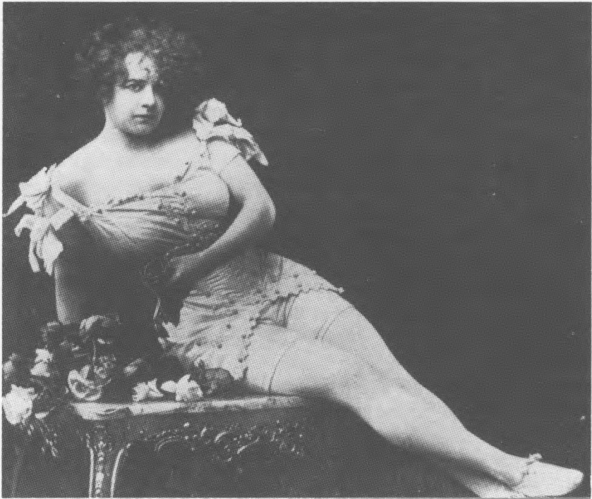
Tanguay, one of the most famous vaudeville stars, appeared in Providence during the week of January 6, 1908.

the researcher knows the dates and locations of the vaudevillians' appearances on the circuit.