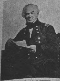
MAJOR GENERAL ETHAN ALLEN HITCHCOCK From a photograph.

The Arthur H. Clark Company Cleveland: 1922