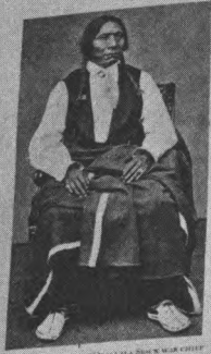
RED CLOUD, THE GREAT ENEMY OF THE SIOUX WAR PARTY Photo taken at Washington, D. C., 1880. An exceptional portrait, showing the great Sioux leader at the age of 48.