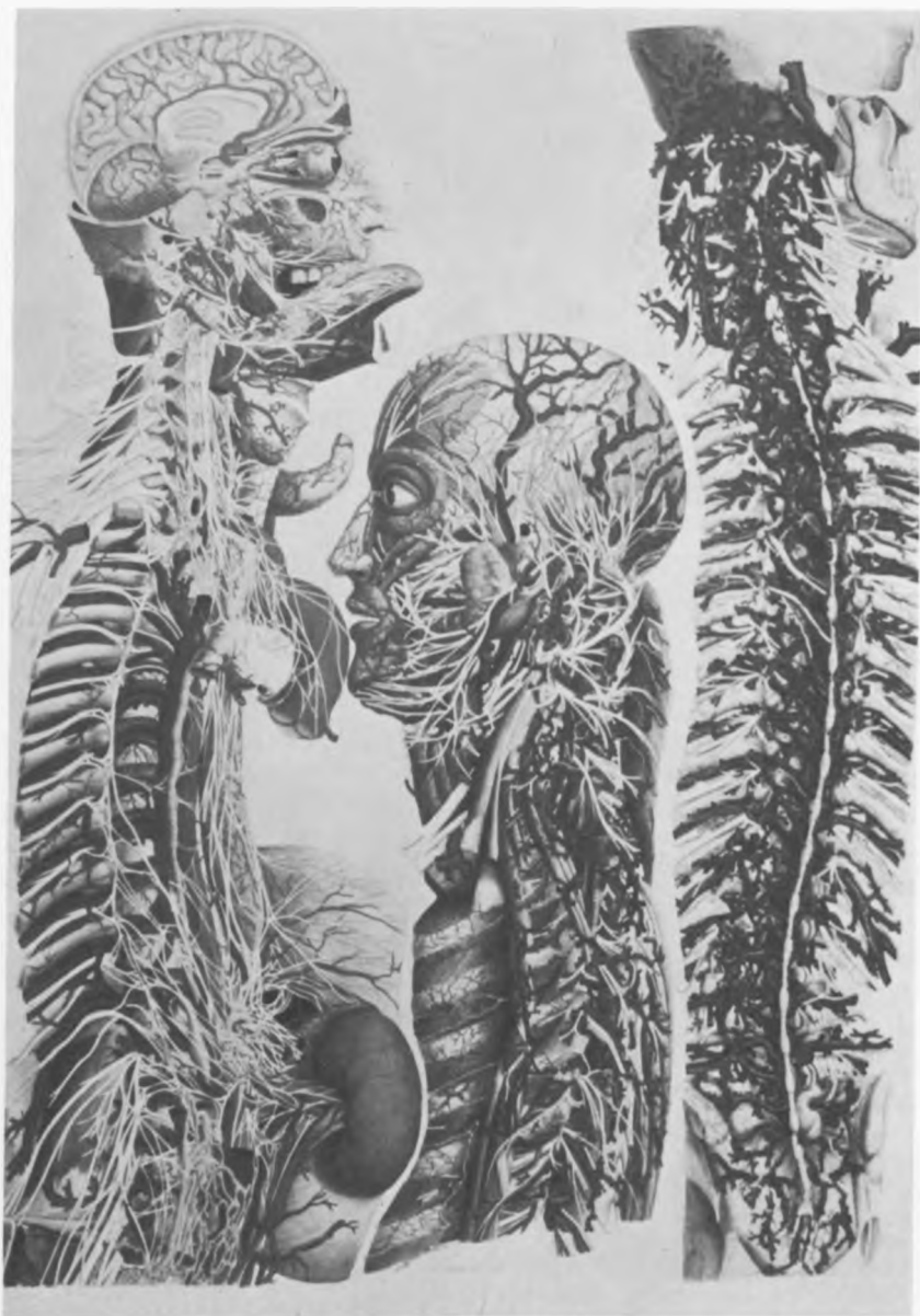
Tabula X from the Anatomia universa of Paolo Mascagni, showing three views of the upper body which depict aspects of the cervical, thoracic, lumbar, and sacral nerves. The original colored plate, with its brilliant blues and reds, is here vastly reduced.