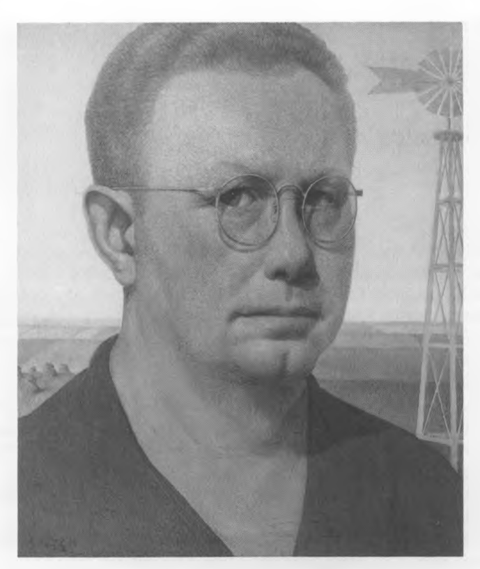
Collection, Davenport Art Gallery, Davenport, Iowa.

He captured the wood creek, Brimming full of notes; He shaped from the lithe birch, Silken swan throats.