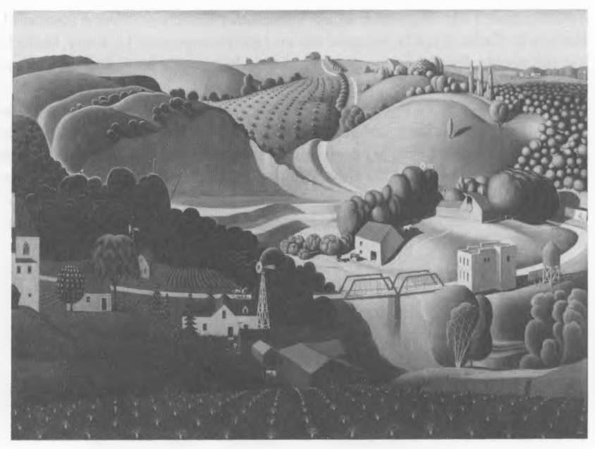
Joslyn Art Museum, Omaha, Nebraska.

The Master's hand was quick and skilled— The Master's dreams were perfect dreams; Then from His clouds a river spilled— The loveliest of streams.