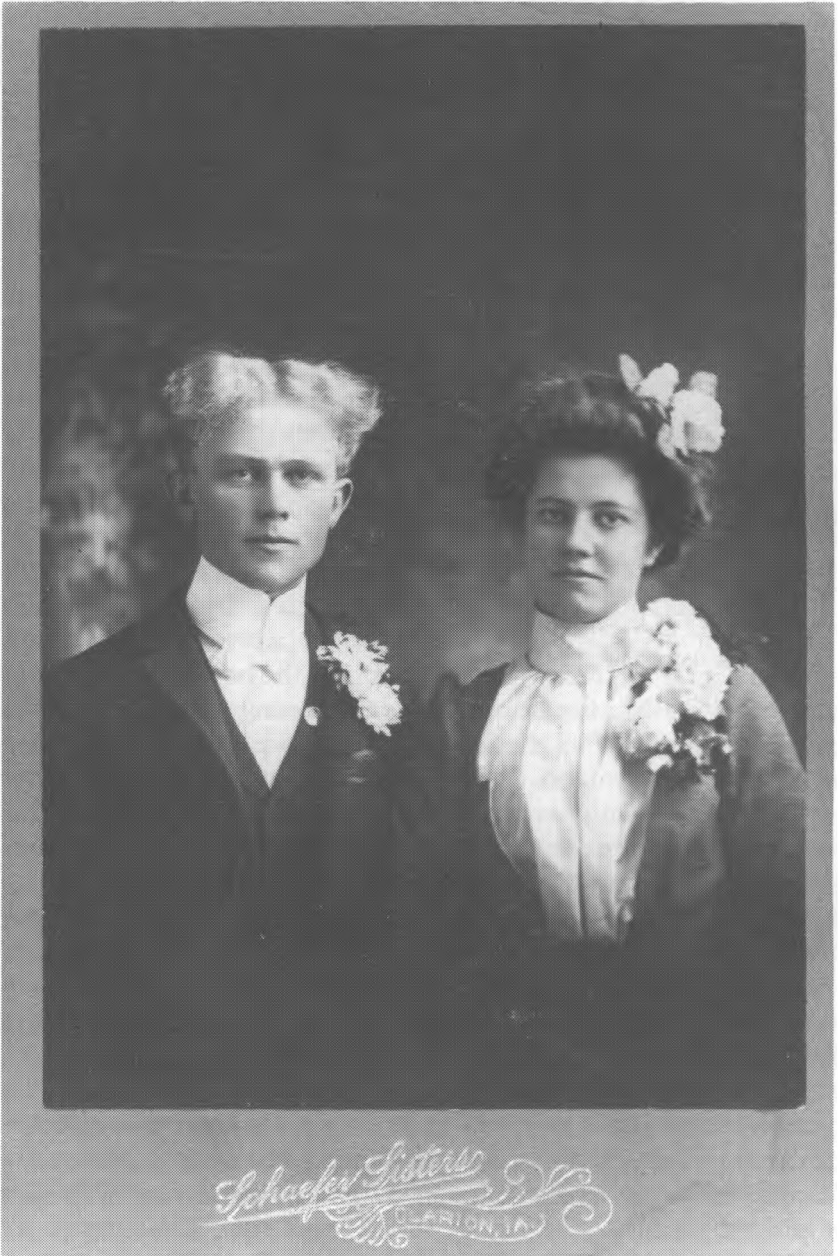
Early twentieth century wedding portrait from the Clarion studio of the Schaefer Sisters.