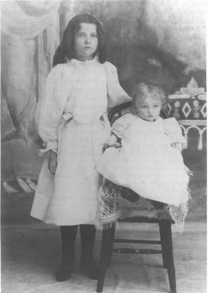
1890s cabinet portrait by Dora Storaker, Roland, Iowa.