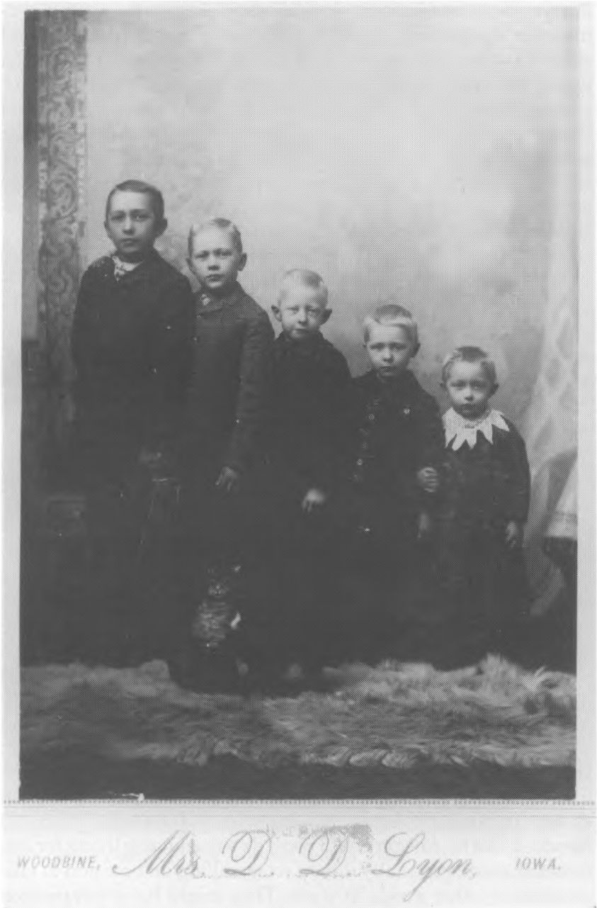
1890s cabinet portrait of five brothers, possibly theatrical performers, and their stuffed cat.