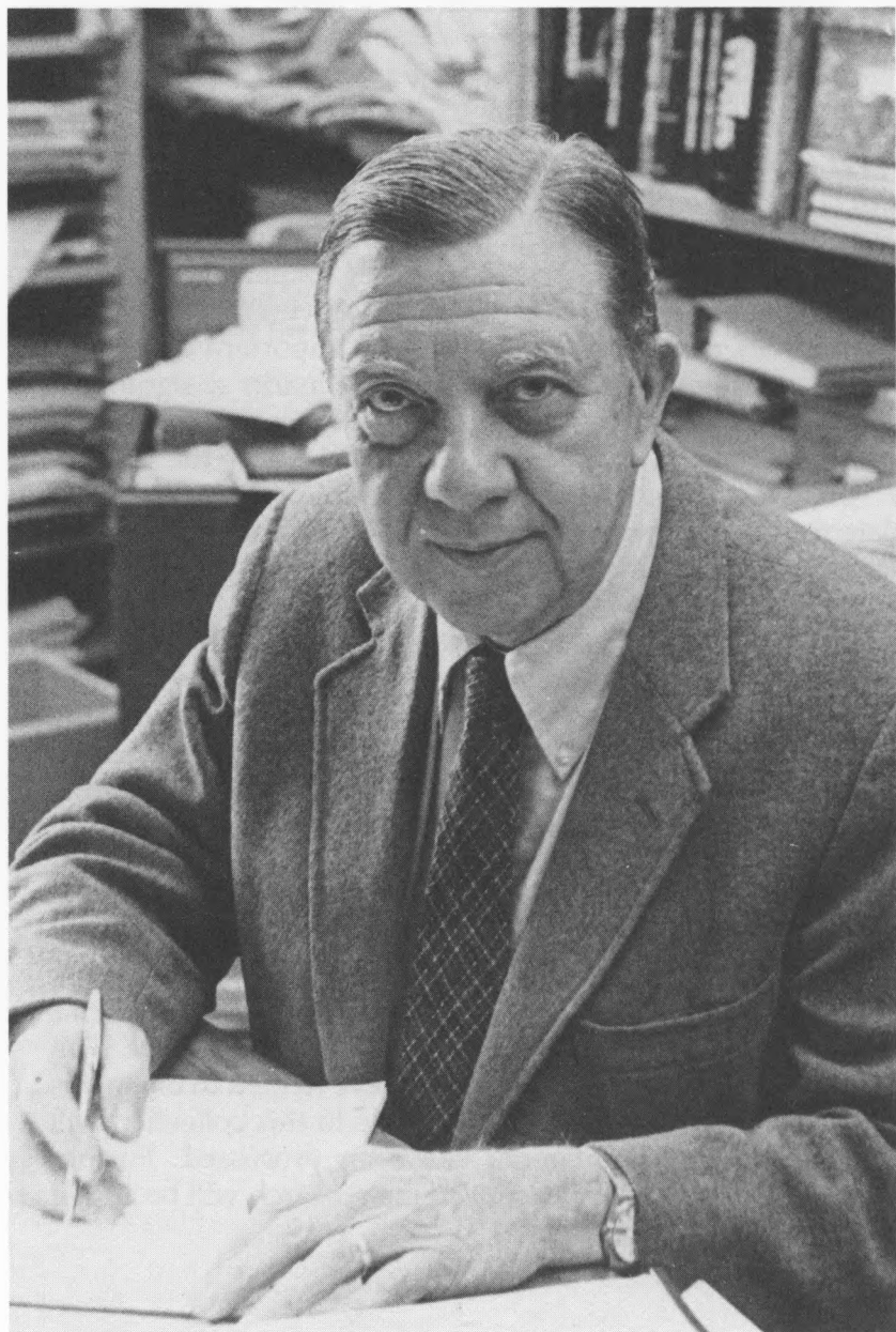
James A. Van Allen in his study.