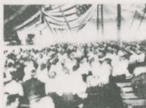
THE BIG TENT