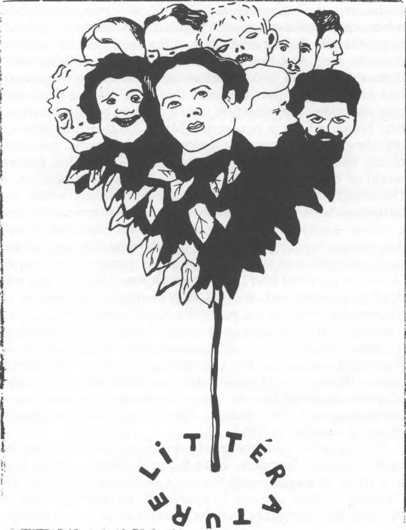
This ironic portrait of some of the Paris Dadaists by Francis Picabia appeared on the cover of Littérature n.s. no. 8 (January 1923).