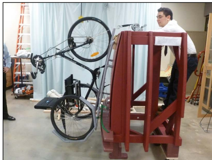
Figure 4. Mockup 2 of mockup of minivan rear with hand cycle attached to the rear door (Dec. 2013). In this mockup, a student lifts the hand cycle with a hand winch, and wheel wells hold the rear wheels securely. This mockup was made of PVC pipe glued with conventional plumbing connectors and was spray painted grey.