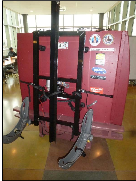
Figure 3. Prototype 2 (final) of storage rack for hand cycle attached to a full-size mockup of a Chrysler minivan (April 2014). The rack was made of 2 in. square aluminum channel welded at the joints. The aluminum was etched and then powder coated. The rack and its components weighed 35 lbs. The plastic wheel wells are from Saris Inc. (Madison, WI).