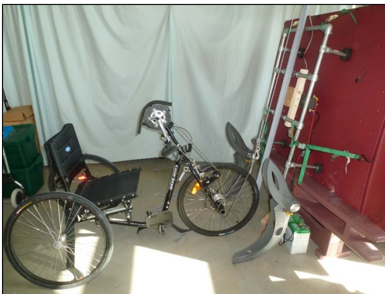
Figure 1. Prototype 1 - hand cycle ready for loading on the rack (Feb. 2014). A full-size mockup of the rear of a Chrysler minivan is shown in the red structure on the right. The rack is mounted to the rear door with six straps. The rack's center rail and plastic wheel wells from Saris Inc. (Madison, WI) support the front and rear wheels, respectively. This prototype was made with iron water pipe and connectors with threads and Allen screws.