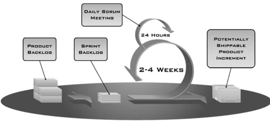
COPYRIGHT © 2005, MOUNTAIN GOAT SOFTWARE

Each sprint begins with a planning meeting and ends with a review and retrospective to assess the success of the sprint and identify areas for improvement in future sprints. Every day, the team holds a short, focused scrum meeting to assess what has been accomplished since the last meeting, identify what will be done by the next meeting and highlight any obstacles or impediments that are impeding progress. Since the intent is to fully integrate new features into a releasable product iteration by the end of each sprint, there is a heavy emphasis on testing, continuous integration, and development of useful (user-oriented) documentation.