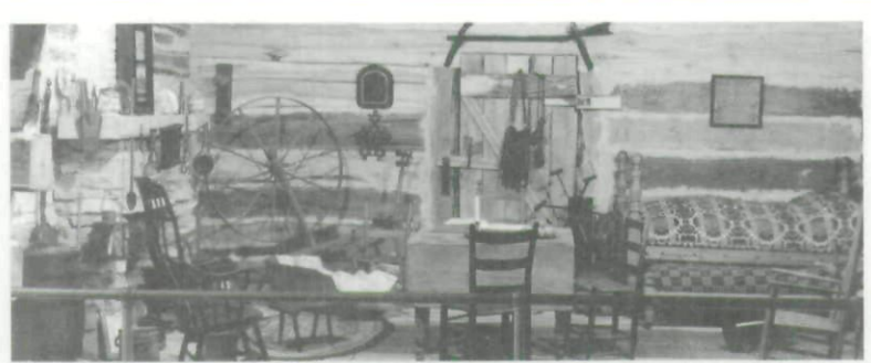
The exhibit mounted by the Iowa Federation of Women's Clubs at the 1938 Iowa State Fair displayed remarkable progress from the pioneer log cabin in its territorial period home (above) to the room in the post—Civil War home (opposite).

believe that farmers would not only endure the depression but would somehow enable the entire nation to survive it as well.<sup>37</sup>