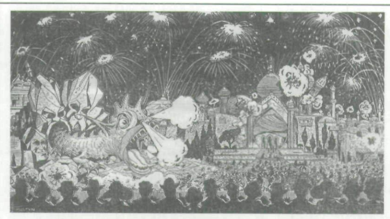
A sketch depicting A Night in Baghdad in Greater Iowa, May 1928.

Only once did the fair's spectacle recreate an event from Iowa history. In 1910 the fair booked a pageant about one of the most shocking episodes in the history of the frontier state. The Pain Company's dramatization of The Spirit Lake Massacre of 1857 , in which a renegade band of Sioux Indians killed 34 settlers, characteristically embellished the story, exaggerating the number of settlers and American Indians involved and inserting a brigade of U.S. Cavalry into the fray, although no volcanoes were added to the relatively gentle Iowa landscape.<sup>28</sup>