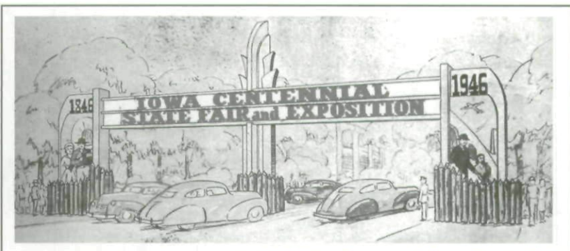
An artist sketched the gate at the 1946 Iowa Centennial State Fair in 1946 for Wallaces' Farmer and Iowa Homestead 71 (1946), 693.

cluded displays of old machinery, modes of travel ranging from ox-carts to airplanes, a full-scale frontier farmstead, pictures of "Livestock Then and Now," and displays of the history of women's fashions and handicrafts.<sup>42</sup>