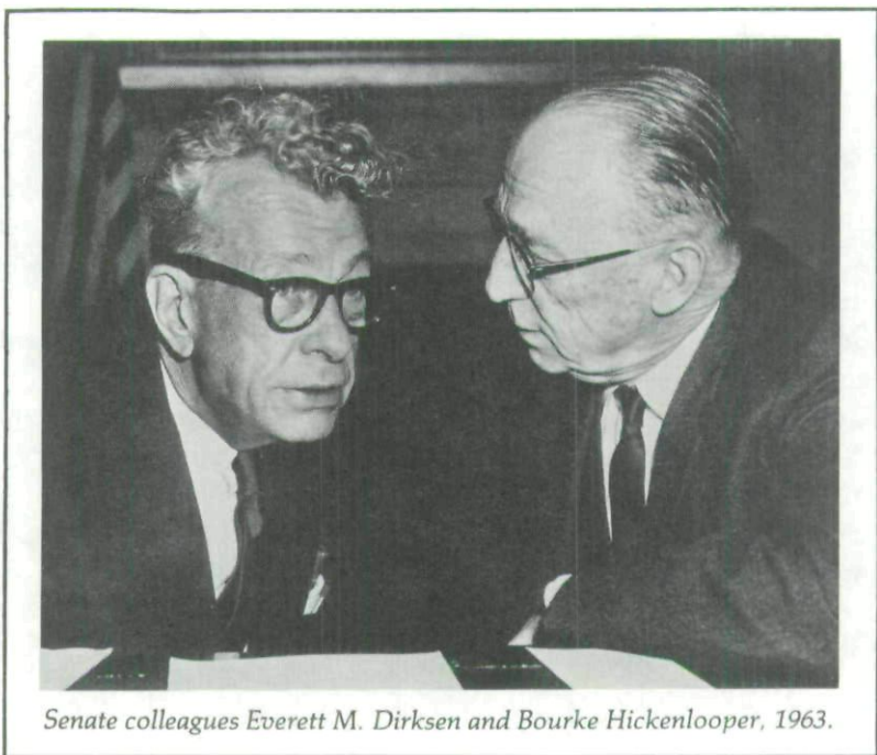
Senate colleagues Everett M. Dirksen and Bourke Hickenlooper, 1963.

area and have devastating adverse influence on the newly developing nation-states of Africa, the Middle East and Latin America. 39